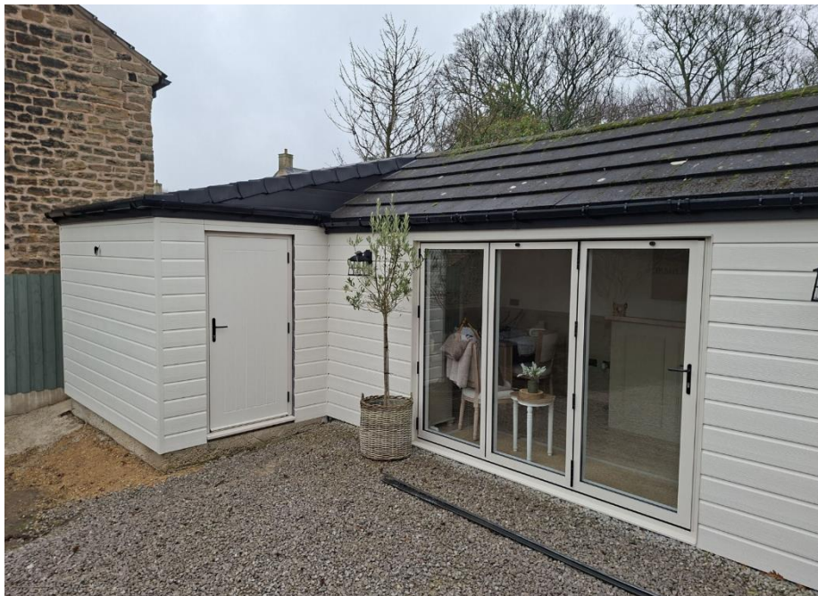
Figure 1 Existing Garage and Extension

The applicant seeks permission for the retention of an extension to an existing outbuilding. The extension is located on the eastern elevation of the existing outbuilding, projecting 3.2m from it and 4.5m along it, extending forward of the northern elevation by 1.9m. The extension has a height of 2.3m to the eaves and 3.2m to the ridge.