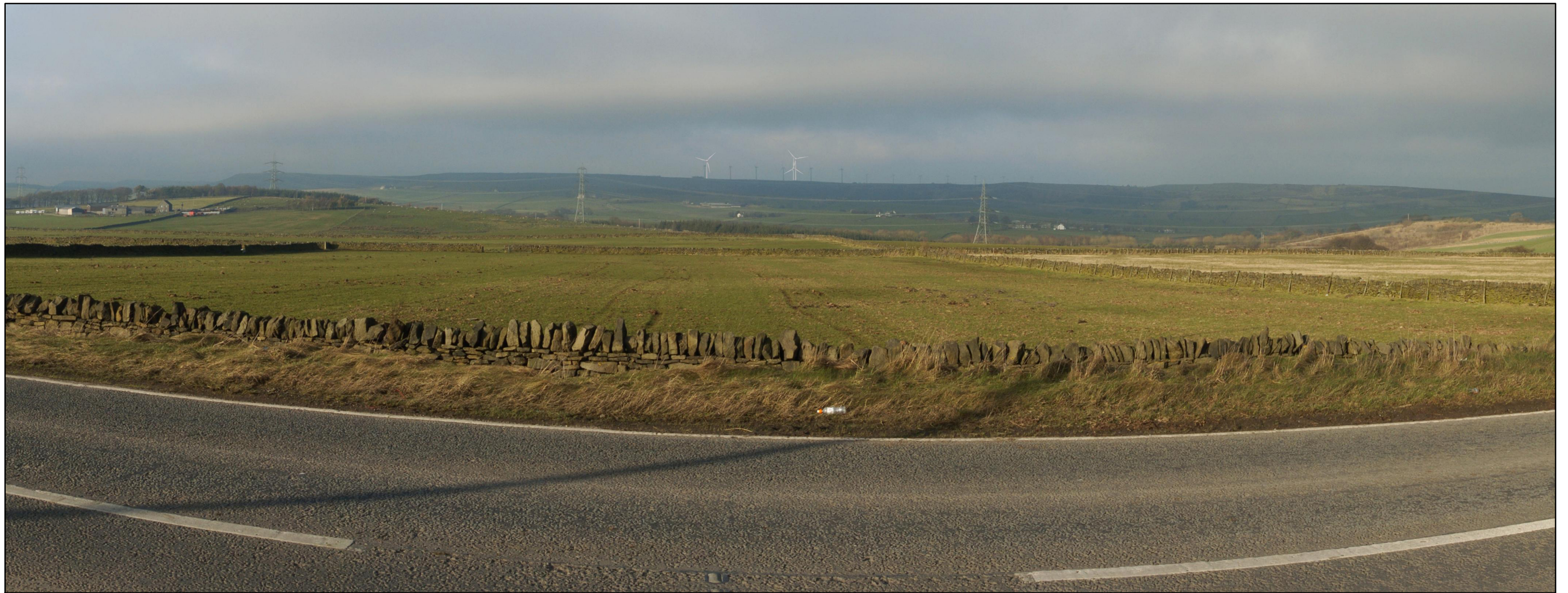
Photomontage showing proposed development from viewpoint