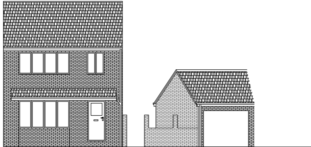
EXISTING FRONT ELEVATION SCALE 1:100 AT A3