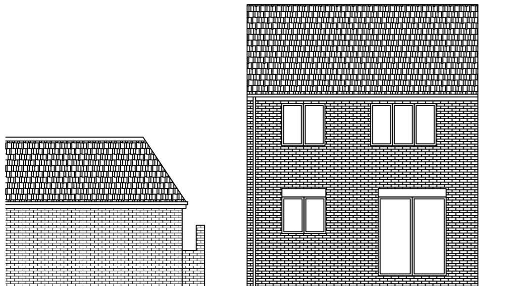
EXISTING REAR ELEVATION SCALE 1:100 AT A3