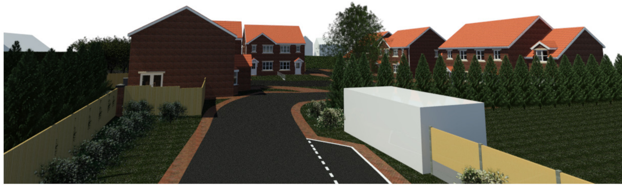
3D View 1 1 : 1