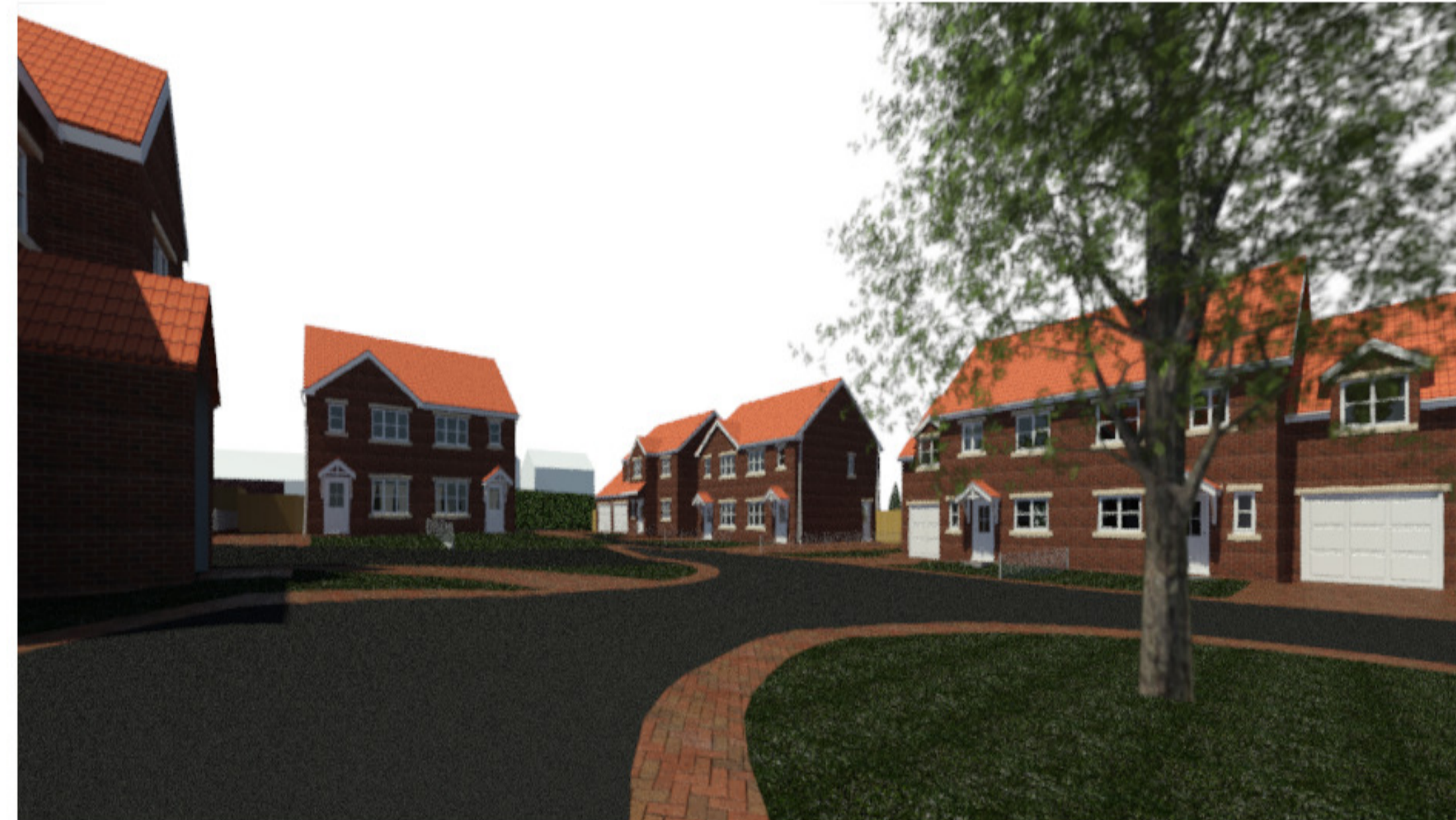
3D View 4 1 : 1