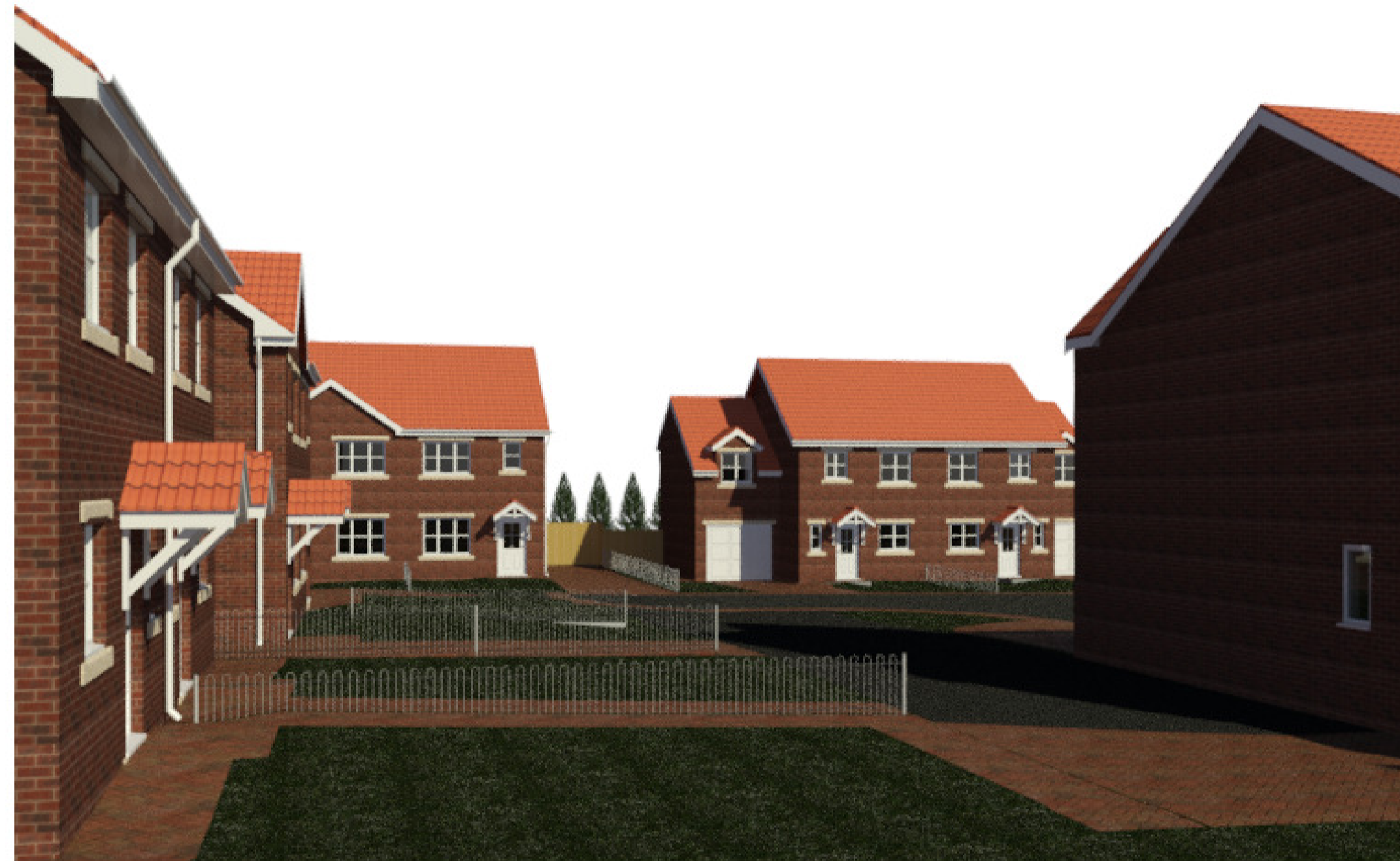
3D View 3 1 : 1