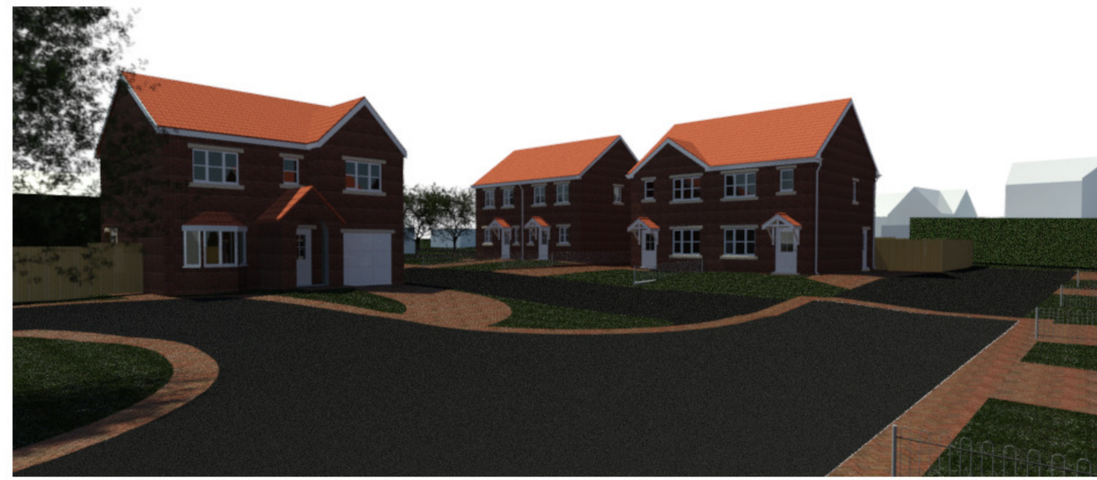
3D View 2 1 : 1