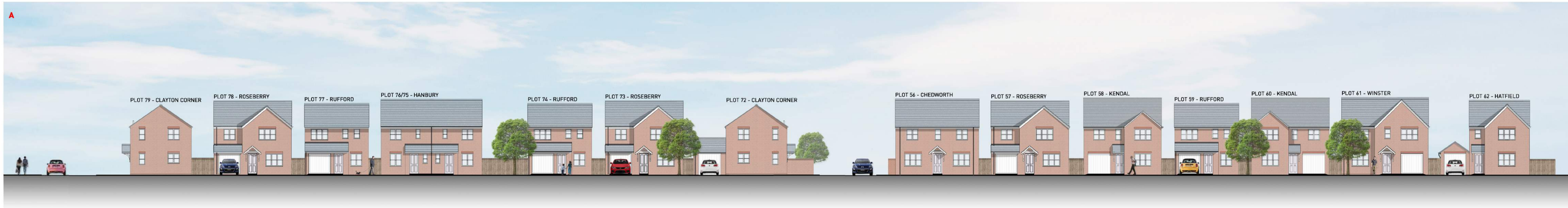
SCALE 1:200 @ A1