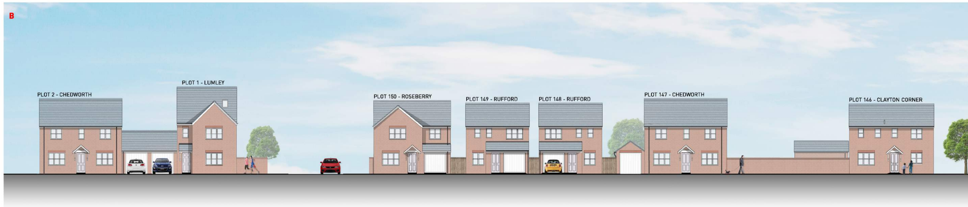
SCALE 1:200 @ A1