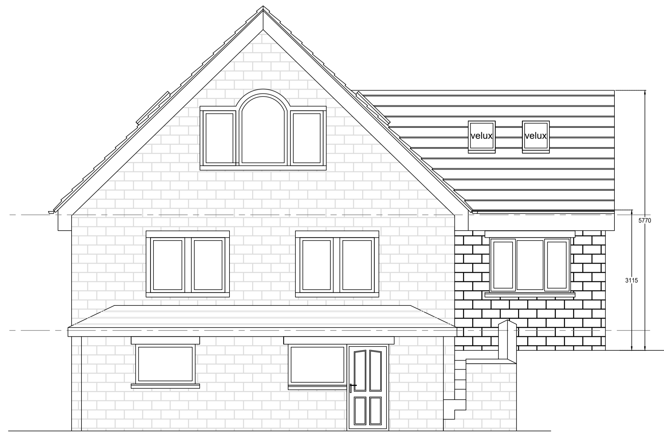
PROPOSED FRONT ELEVATION - scale 1:50