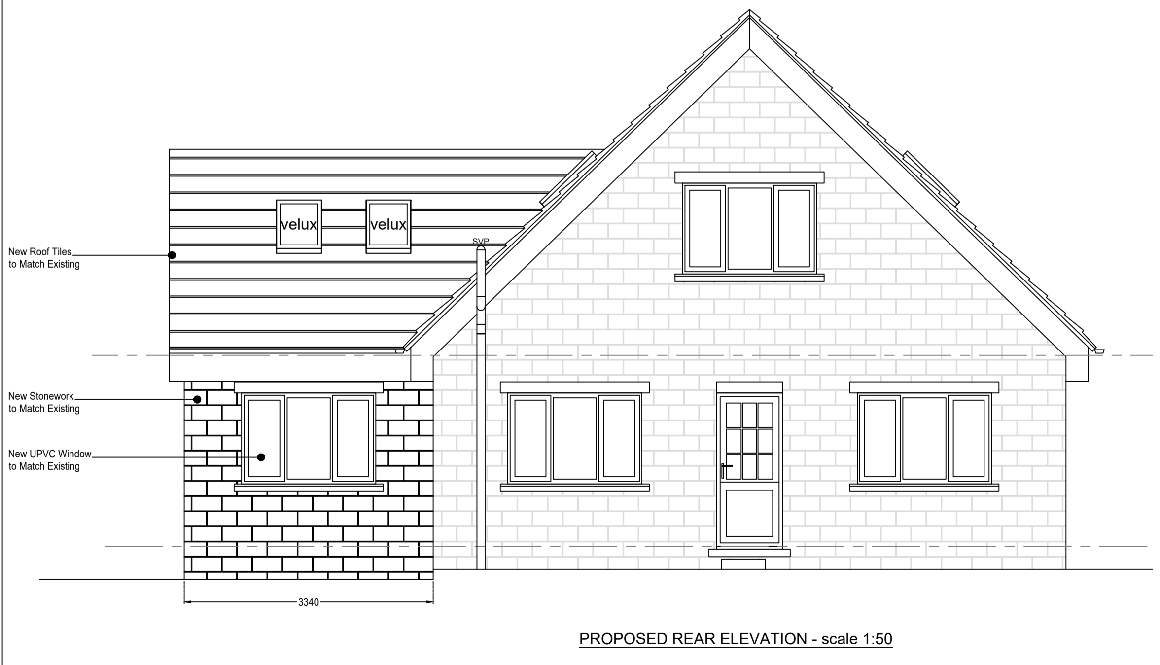
PROPOSED REAR ELEVATION - scale 1:50