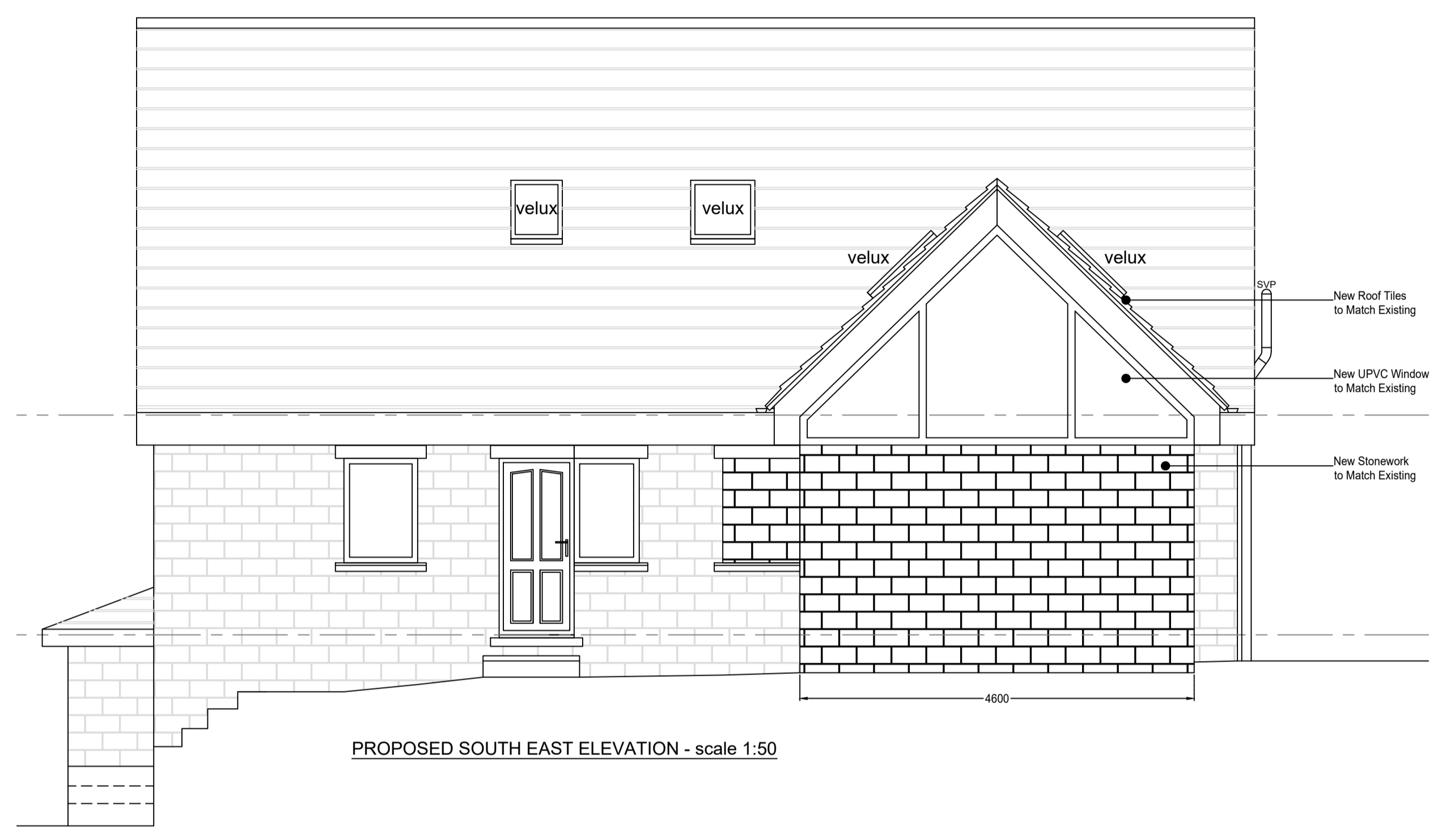
PROPOSED SOUTH EAST ELEVATION - scale 1:50