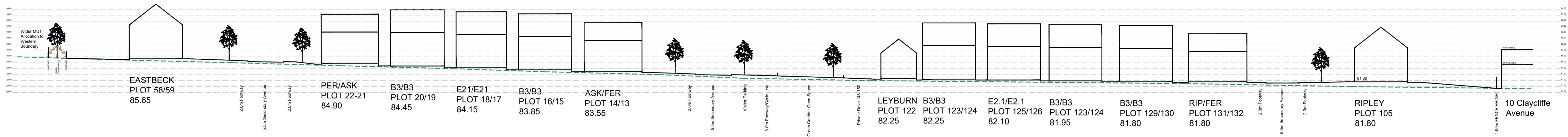
TYPICAL EAST - WEST CROSS SECTION A-A THROUGH CENTRAL SITE AND 10 CLAYCLIFFE AVENUE