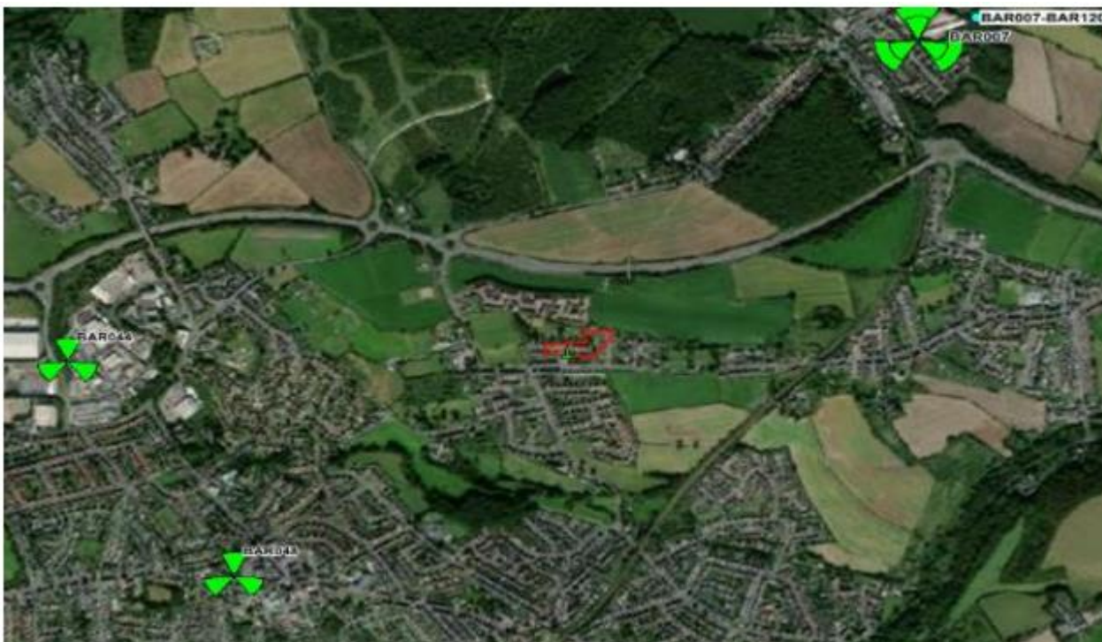
Figure 4 - Coverage Map: Proposed installation must be located close to the area shown below.

The optimum solution from the perspective of cell planning and radio coverage has been put forward. The target Search Area (shown as by the red outline) and existing H3G (Three) UK sites are illustrated within Figure 4 below: