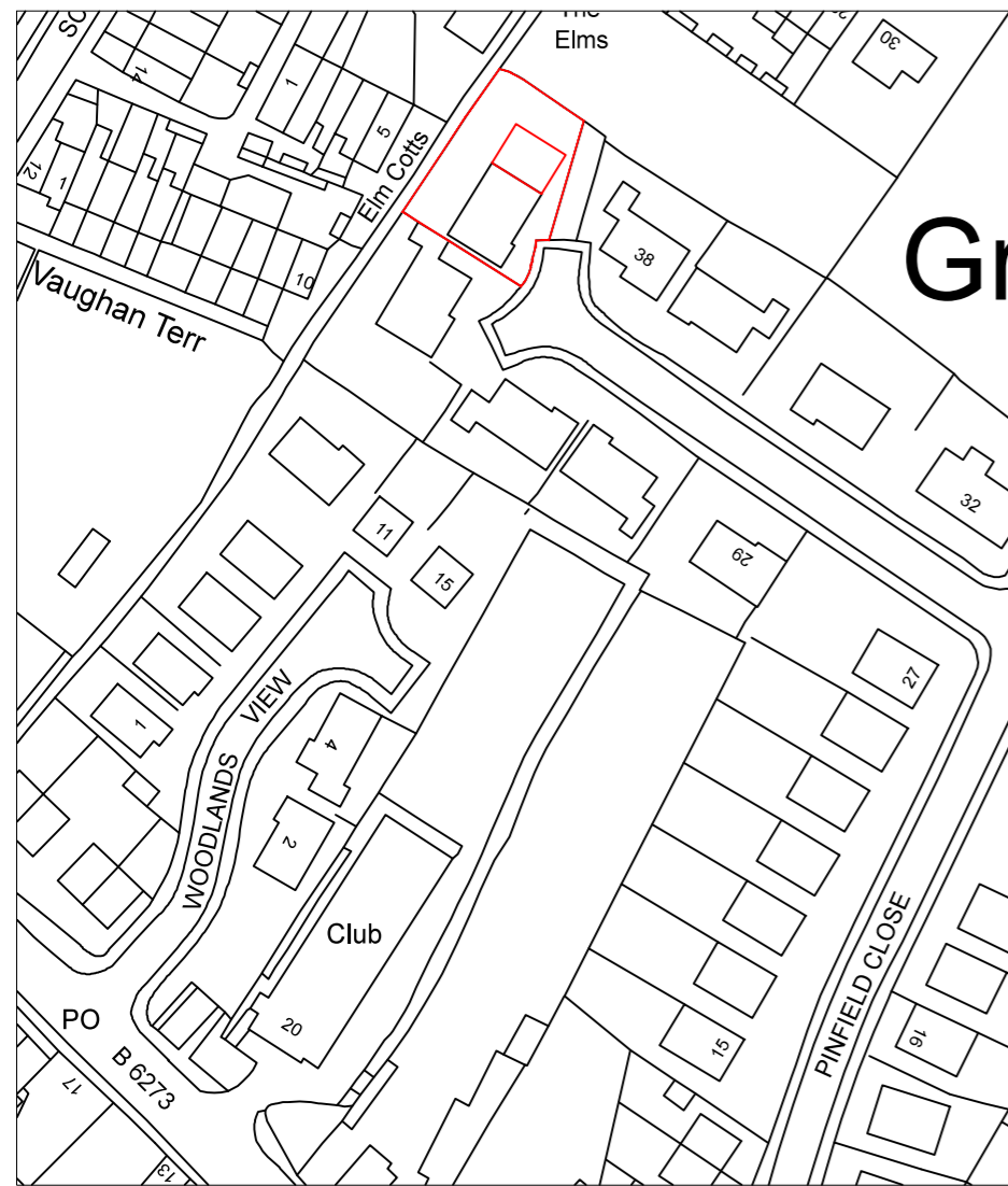
LOCATION PLAN SCALE 1:1250 AT A3