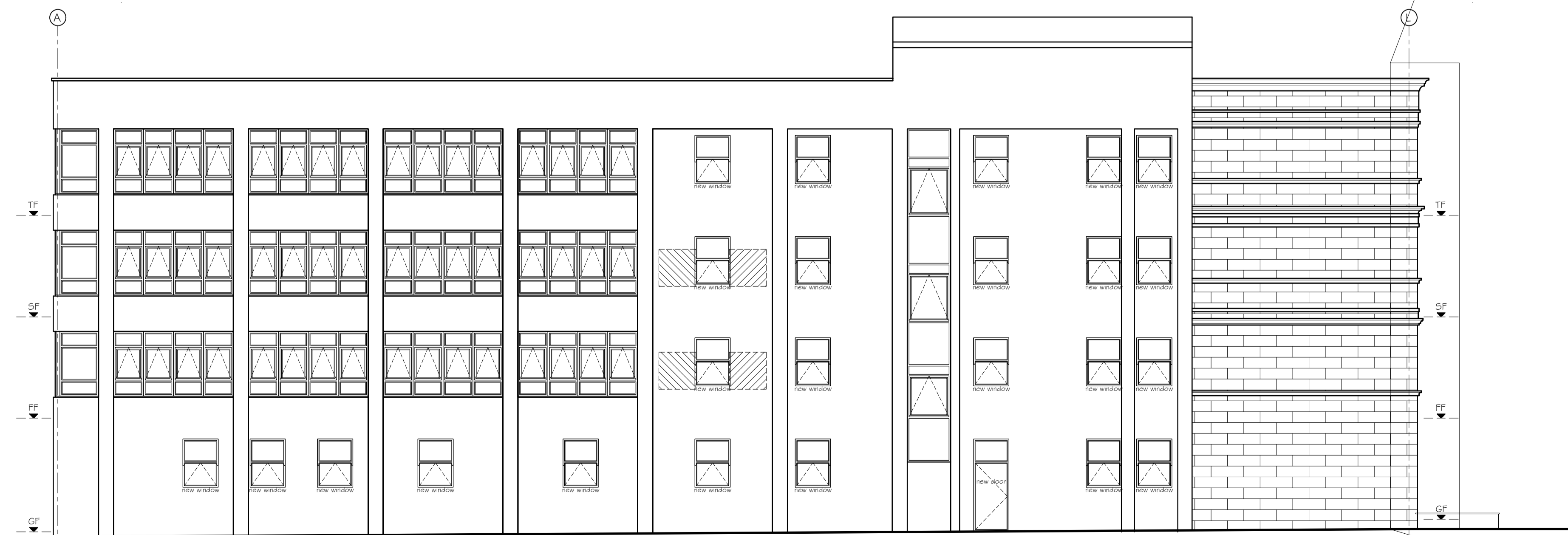
SIDE (WEST) ELEVATION