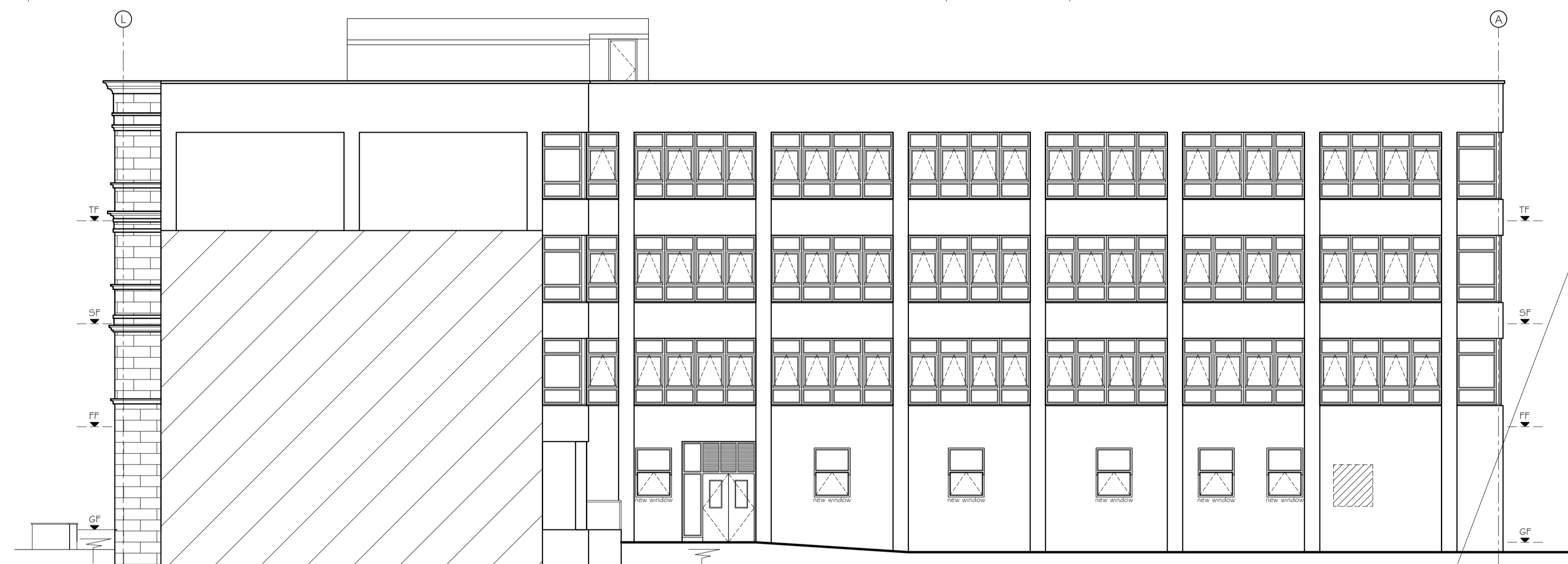
SIDE (EAST) ELEVATION