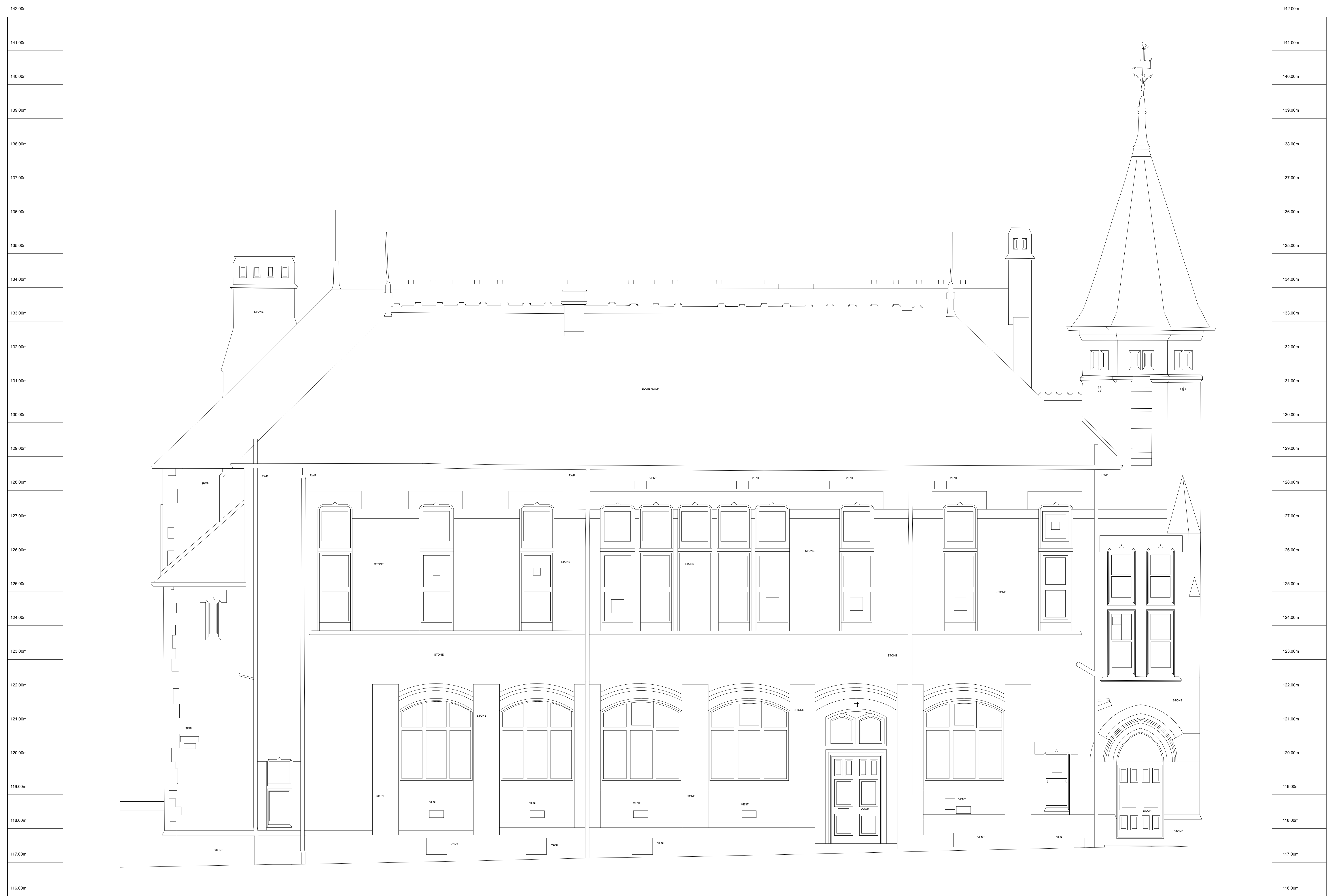
Existing East Elevation 1:50

NOTES: EXISTING ELEVATIONS — EXISTING ELEVATIONS TAKEN FROM BUILDING SURVEY 'P23-004 1E-MET-EXT-XX-ELE-M2-B-001-1-ELEVATIONS' BY MET GEO ENVIRONMENTAL, RECEIVED 2023-09-05