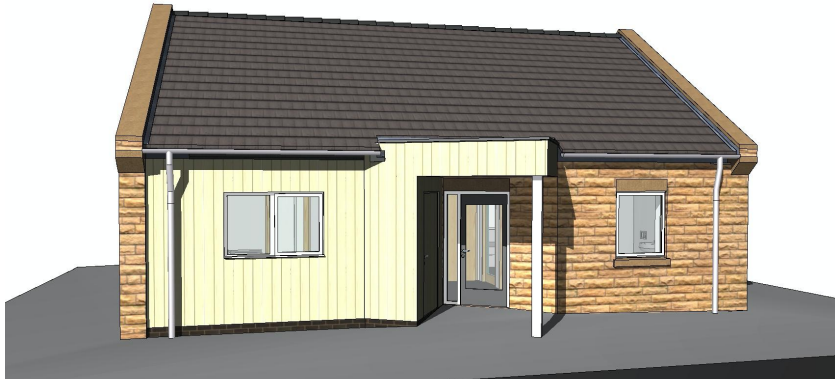
Bungalow Type 2A - Perspective View