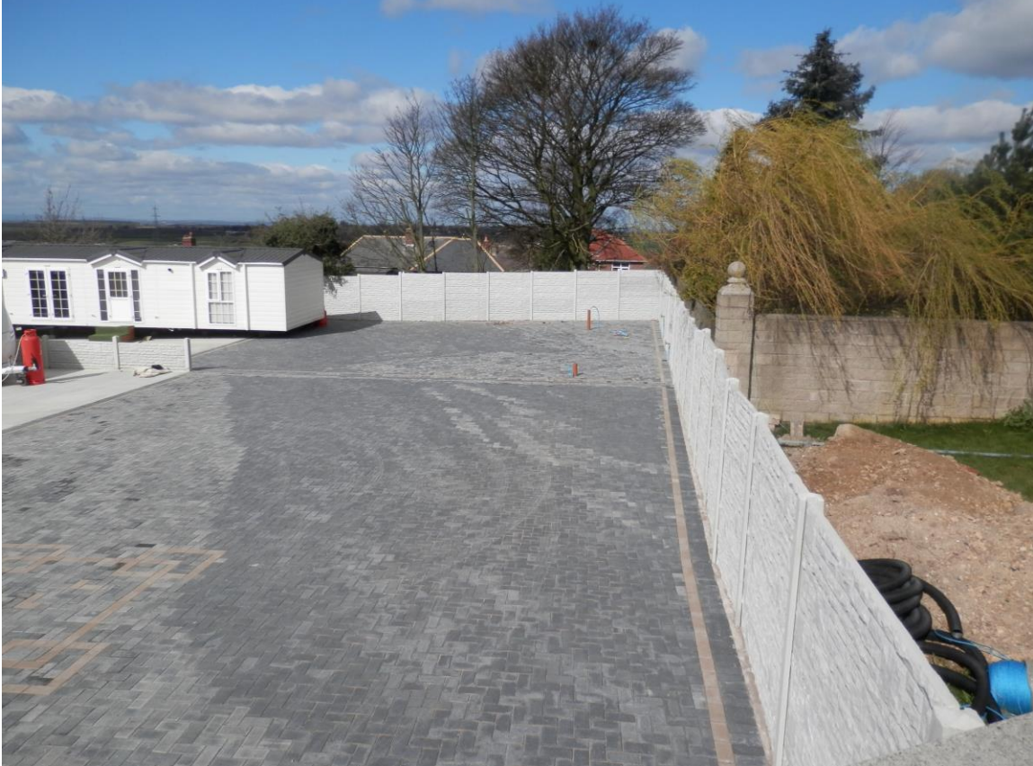
Fence to northern (with Barnsley Road) and eastern (with 2a and 4a Connor House on Cliff Lane)