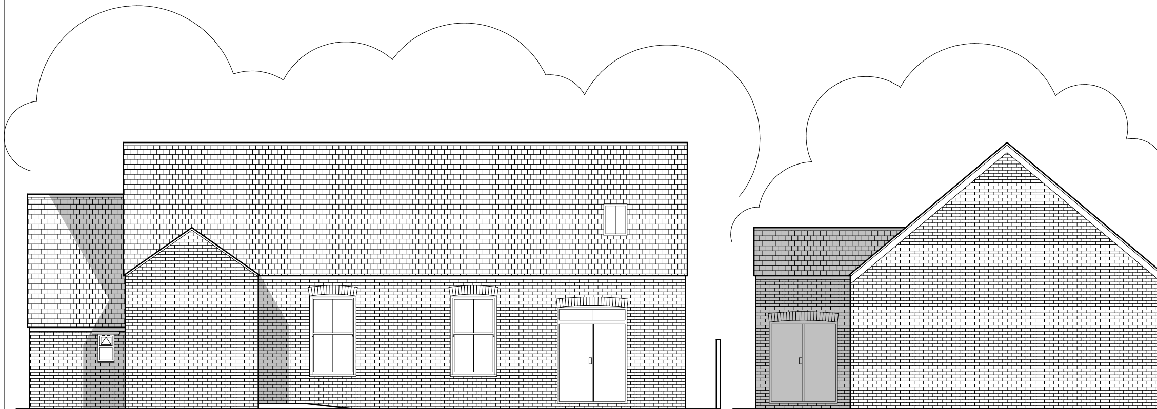
Front Elevation to Blacker Hill.

IT IS THE RESPONSIBILITY OF THE OWNER/CLIENT TO SERVE A NOTICE ON THE ADJOINING OR ADJACENT NEIGHBOURS FOR THE PROPOSED WORKS UNDER THE PARTY WALL ACT 1996: EXPLANATORY BOOKLETS CAN BE OBTAINED FREE OF CHARGE FROM THE ODPM FREE LITERATURE, PO BOX 236, WEST YORKSHIRE, LS23. 7NB. TELEPHONE 0870-120-7405 E-mail: odpm@twoten.press.net