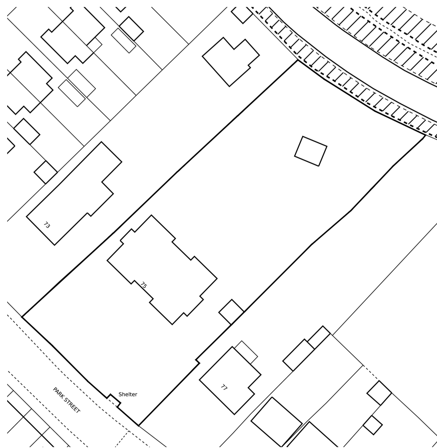
Existing Site Block Plan