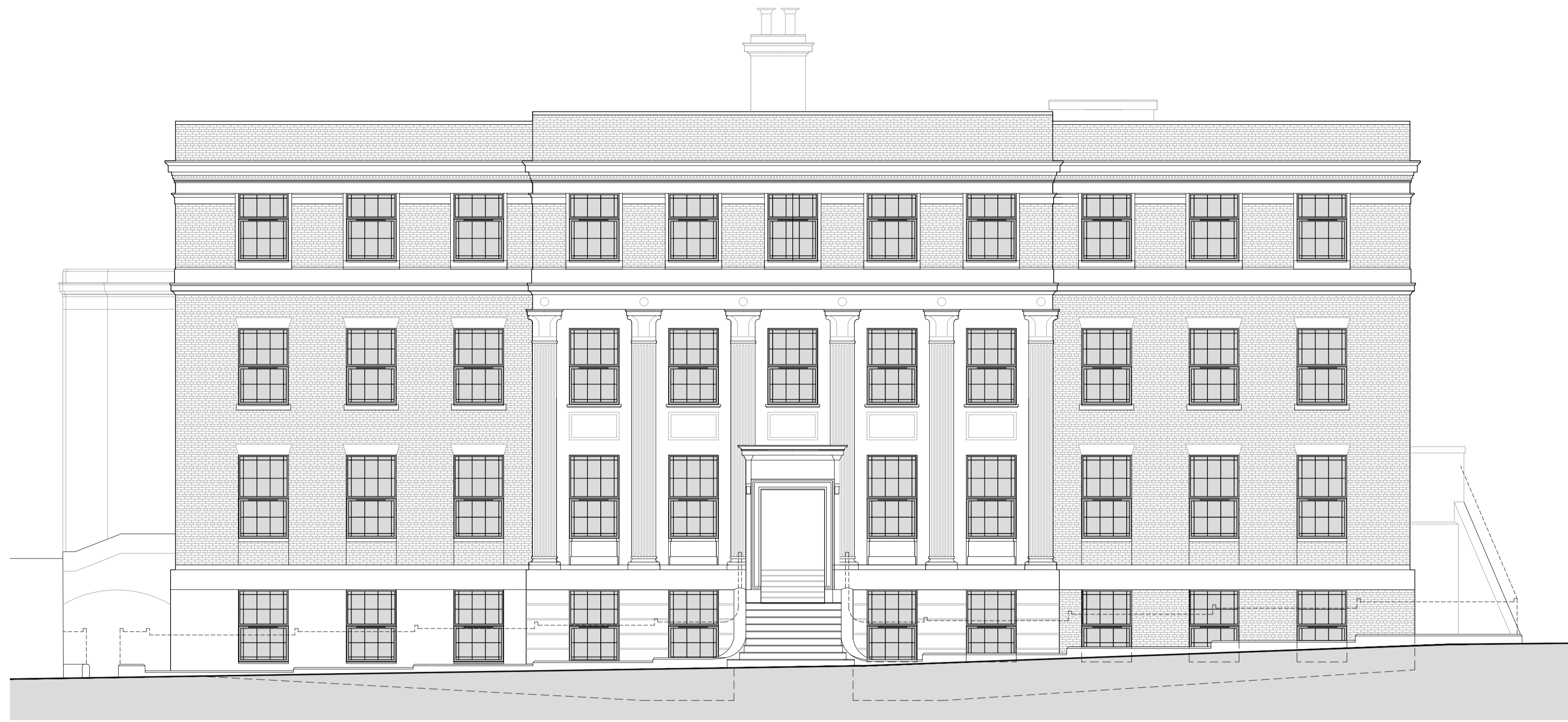
EXISTING FRONT EAST ELEVATION 1:100 @ A1