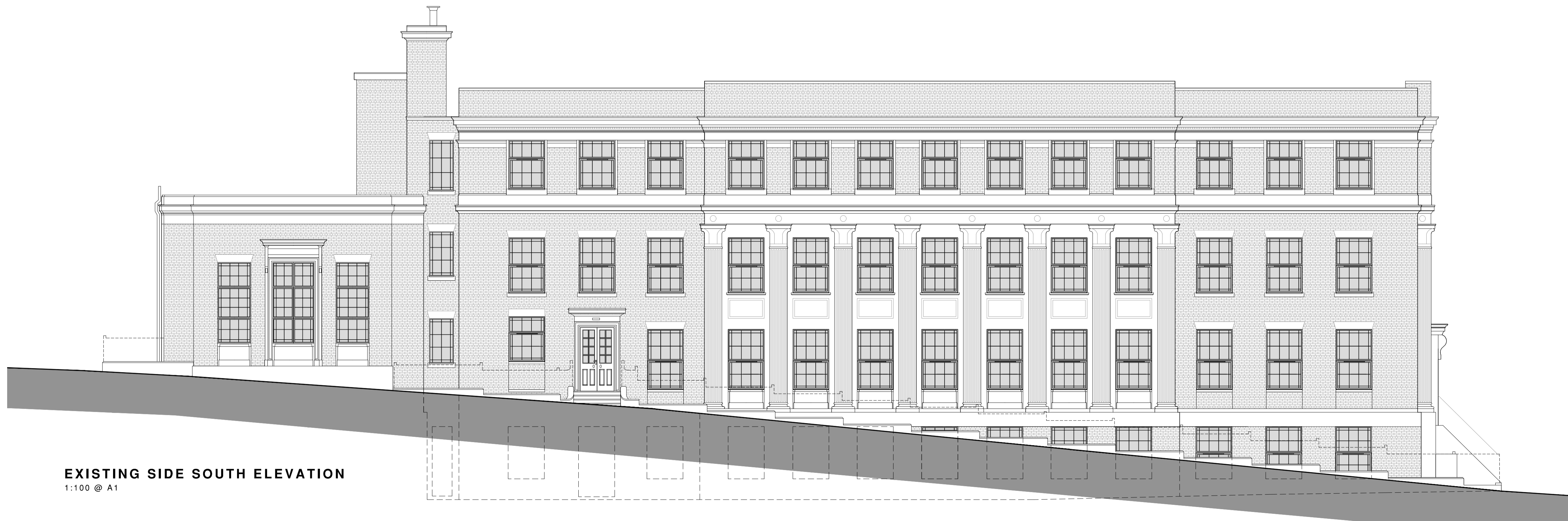
EXISTING SIDE SOUTH ELEVATION 1:100 @ A1