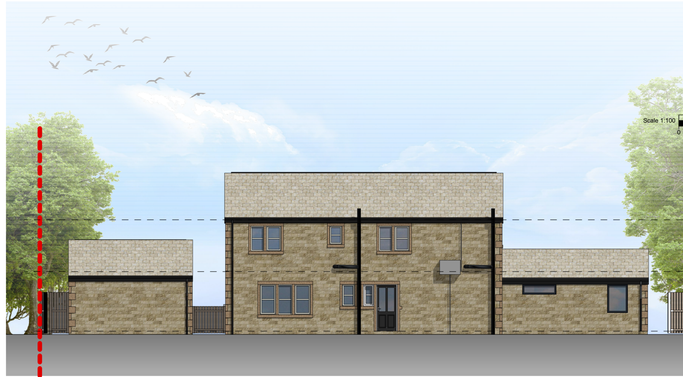
Existing NE Elevation