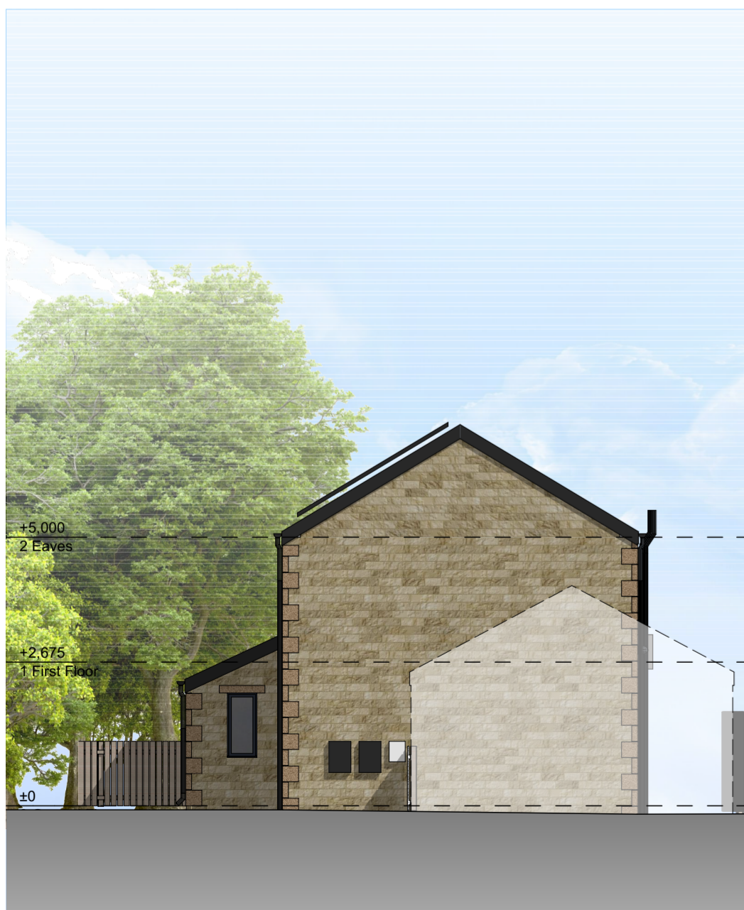
Existing SE Elevation