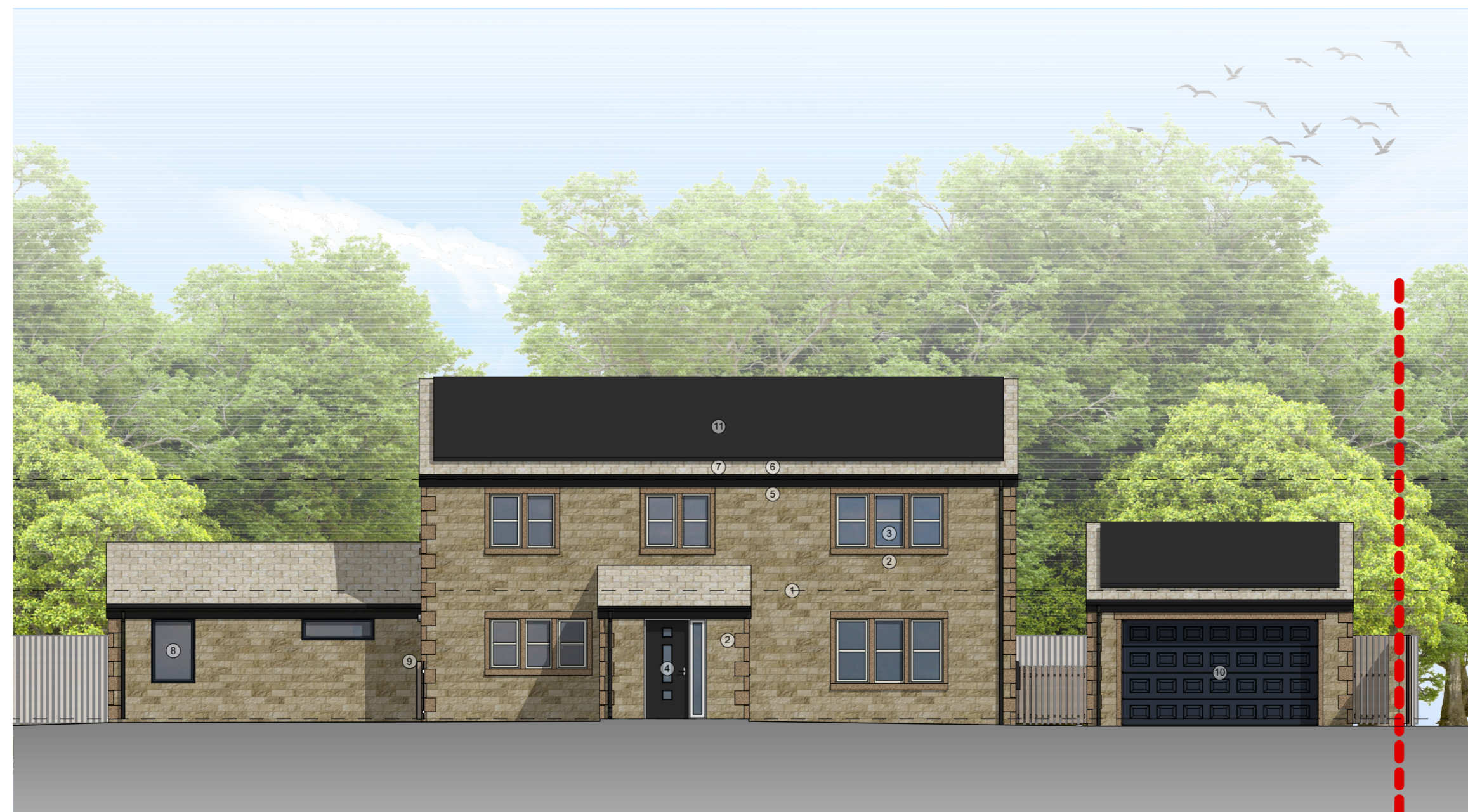
Existing SW Elevation

NOTE Drawing use for status issued for only. Feasibility & Planning drawings are not intended for construction or manufacture. J Mahoney Architects Ltd cannot accept any responsibility for issues arising due to this. All dimensions to be checked on site and any discrepancies to be notified prior to the commencement of work. Do not scale from this drawing. If in doubt ask © J Mahoney Architects