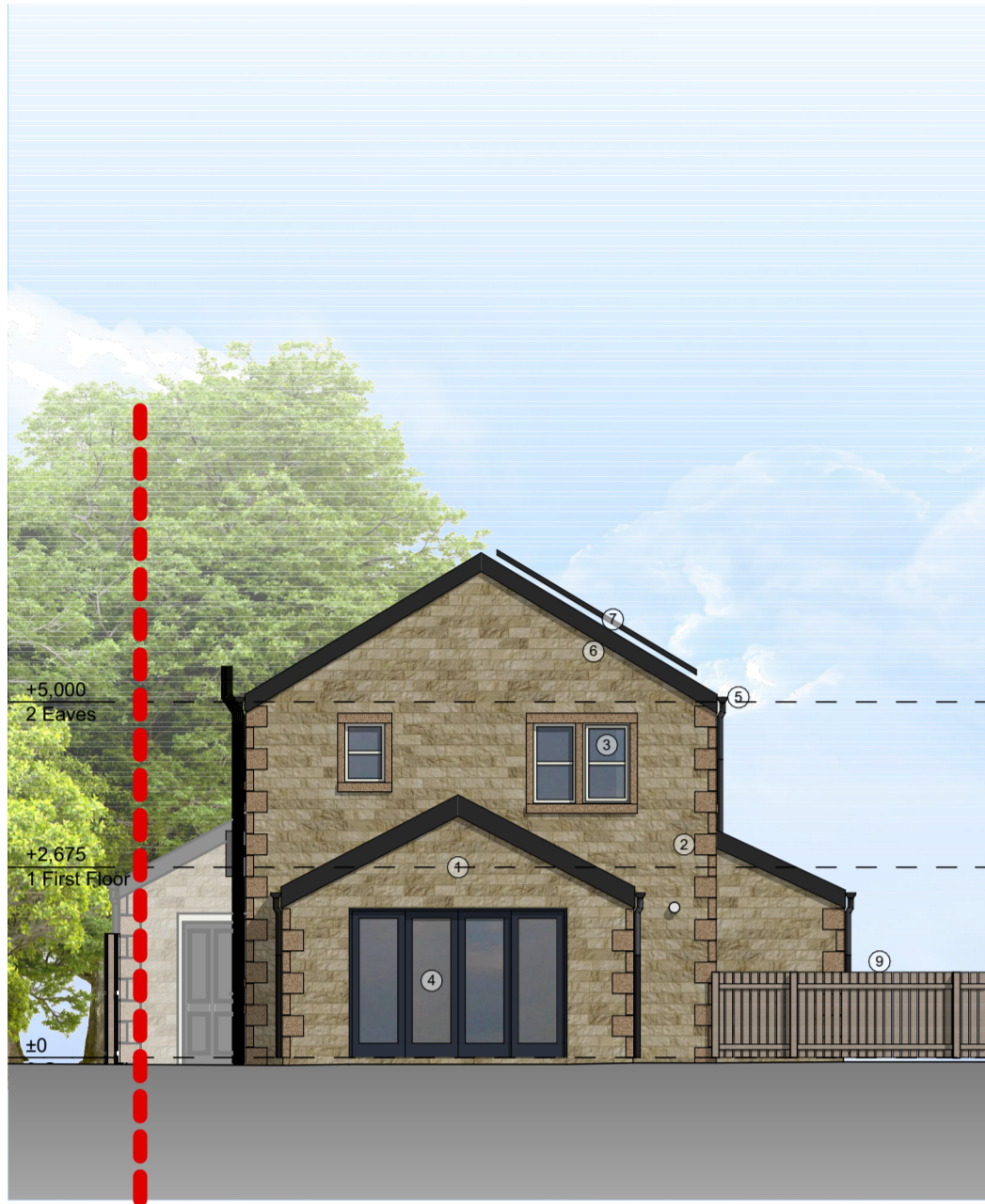
Existing NW Elevation