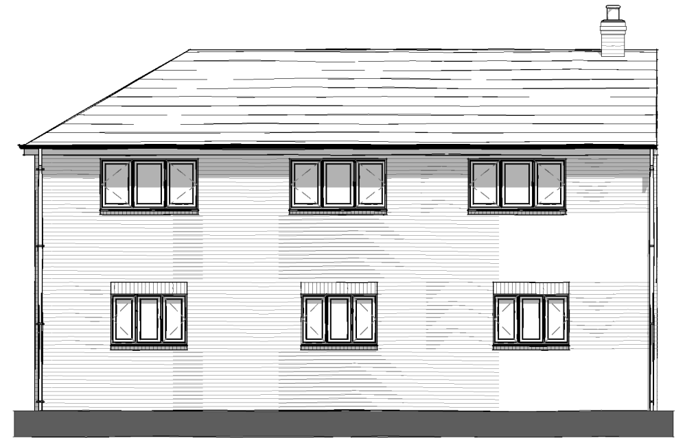
Rear Elevation. 1 : 100