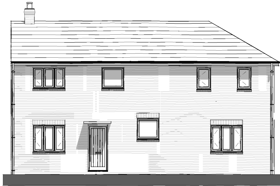
Front Elevation. 1 : 100