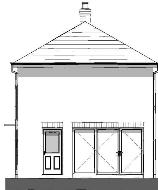
Right Side Elevation. 1 : 100