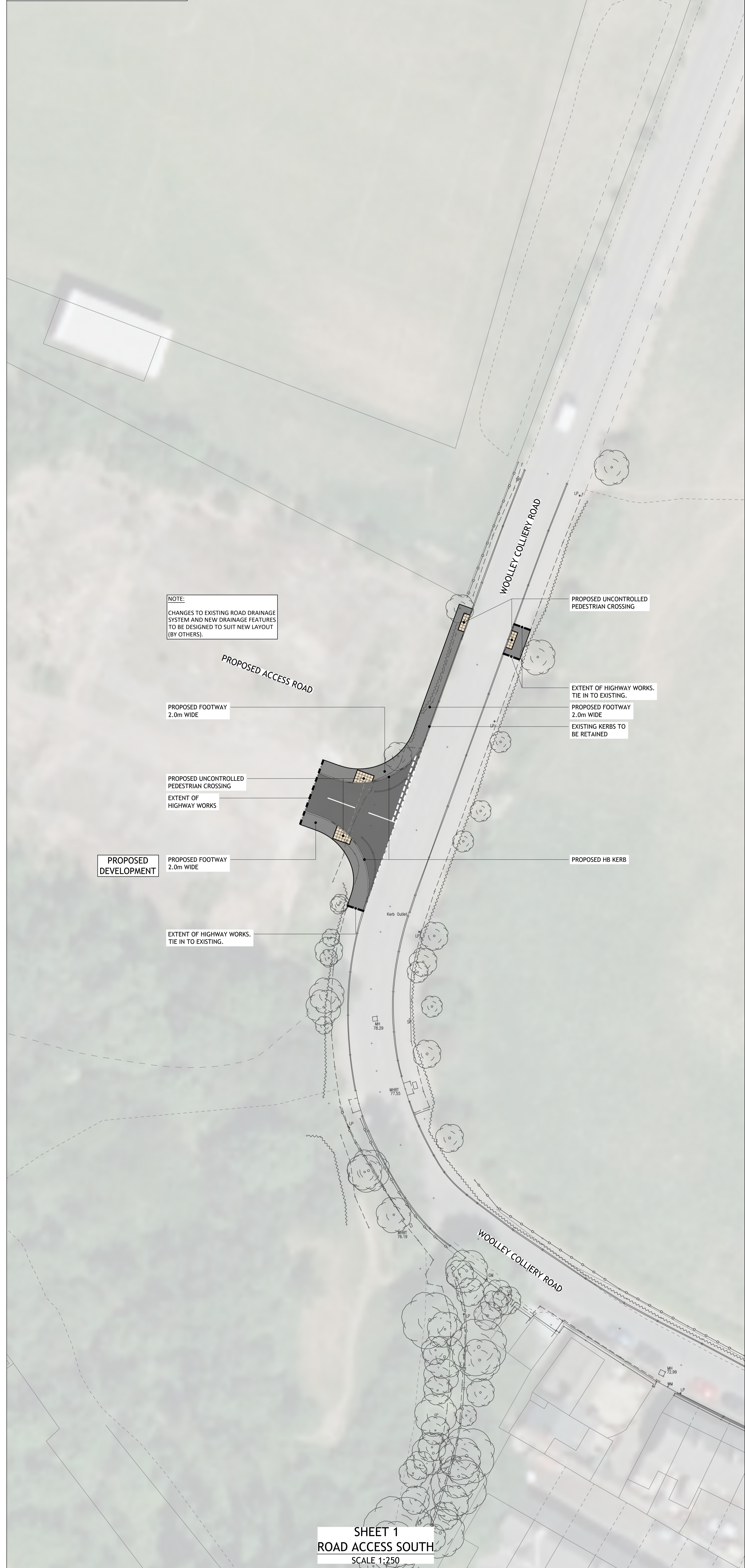
SHEET 1 ROAD ACCESS SOUTH SCALE 1:250