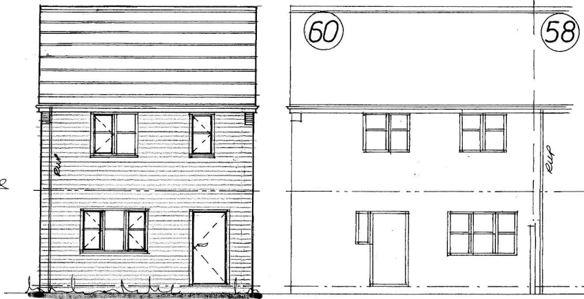
Front ~ Street Scene ~ Coronation Drive

UPVC WHITE DOOR & WINDOWS. INC ALL RAINWATER & SOIL GOODS