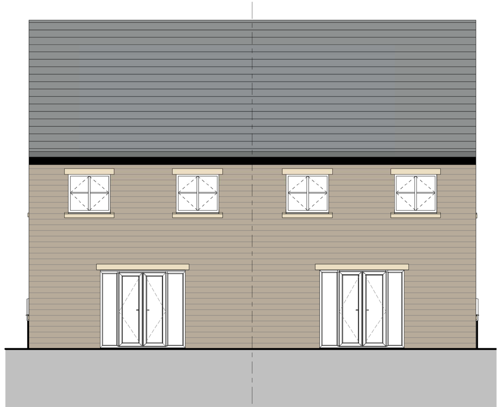
3 Rear Elevation 1 : 50

RESPONSIBILITY IS NOT ACCEPTED FOR OTHERS SCALING DIRECTLY FROM THIS DRAWING. DO NOT SCALE FROM THIS DRAWING. USE WRITTEN DIMENSIONS ONLY.