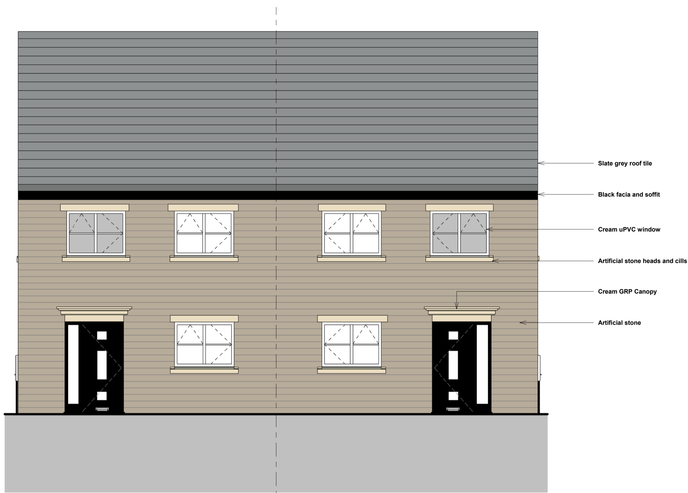
1 Front Elevation 1 : 50