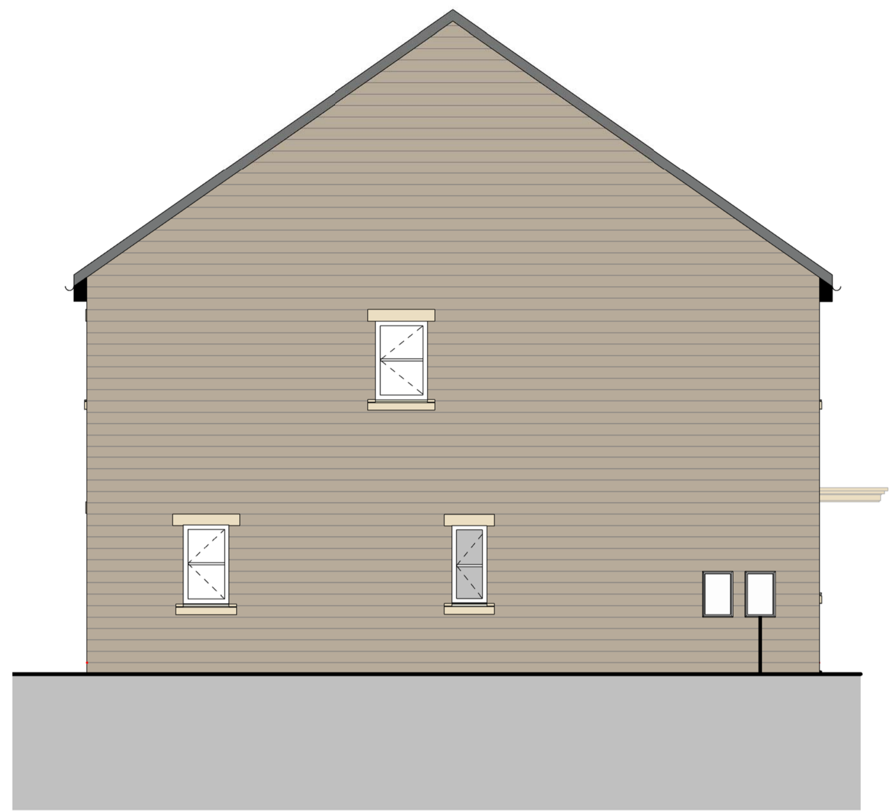
4 Side Elevation 1 : 50