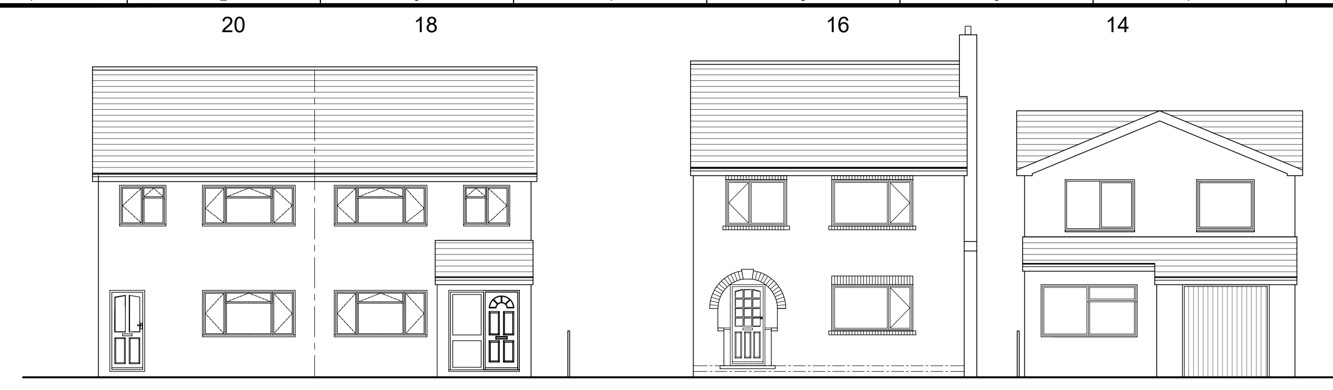
EXISTING STREET SCENE