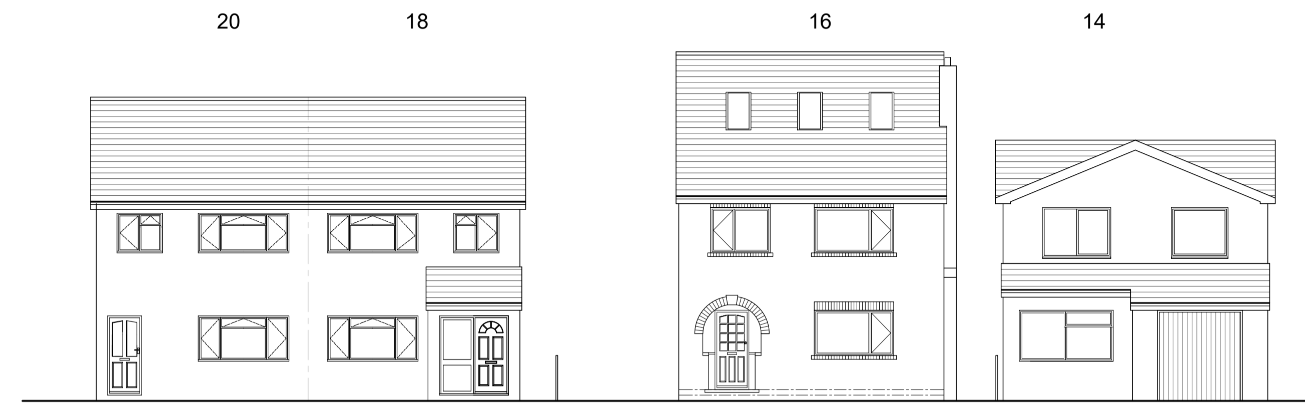
PROPOSED STREET SCENE