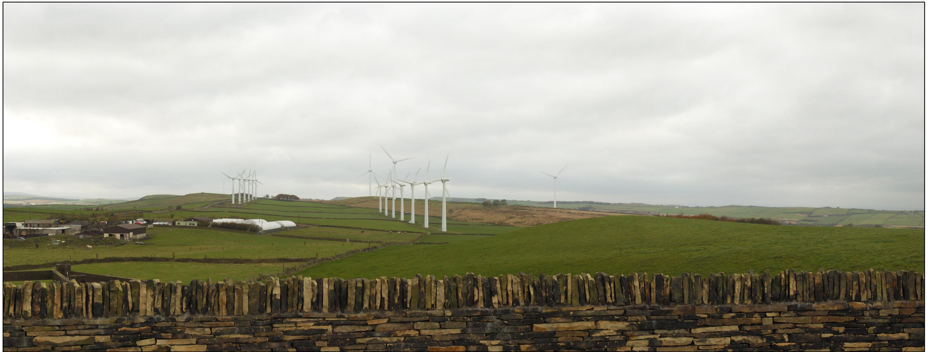
Photomontage showing proposed development from viewpoint