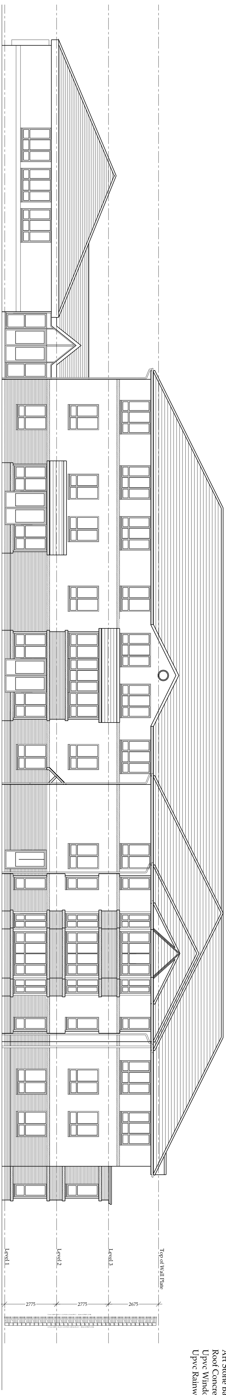
1335 L [0] 21 South West Elevation as Proposed

Roof Pitch 26.5° Walls in Facing Brickwork Art Stone Banding Roof Concrete Roof Tiles UPVC Windows UPVC Rainwater Goods