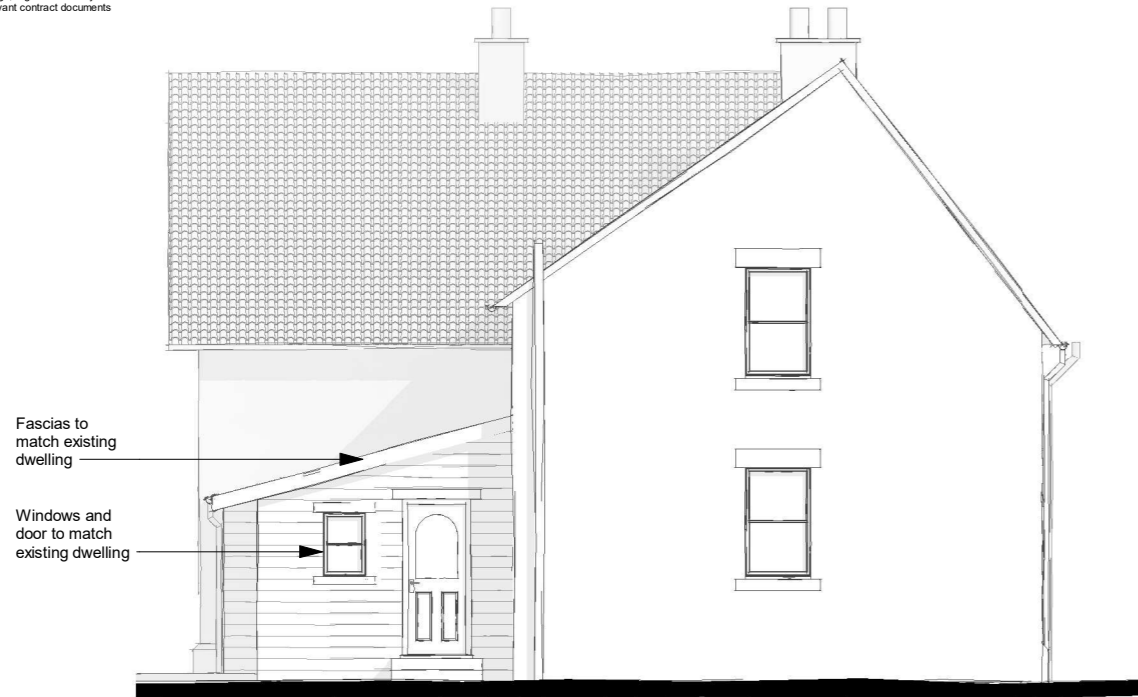
North Proposed Scale 1 : 100

This drawing is the copyright and remains the property of Charrette Architecture Ltd and must not be reproduced in whole or in part without their written permission. Do not scale from this drawing. Refer to printed dimensions only. All dimensions are to be checked by using site measurements and discrepancies reported to the designers. This drawing must be read in conjunction with all other Consultants and Subcontractors drawings, together with any written specifications and relevant contract documents