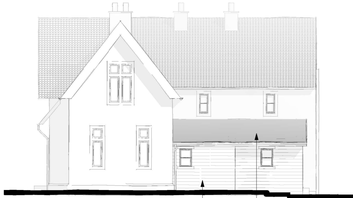
East Proposed Scale 1 : 100

Stone to match existing dwelling Roof tiles to match existing dwelling