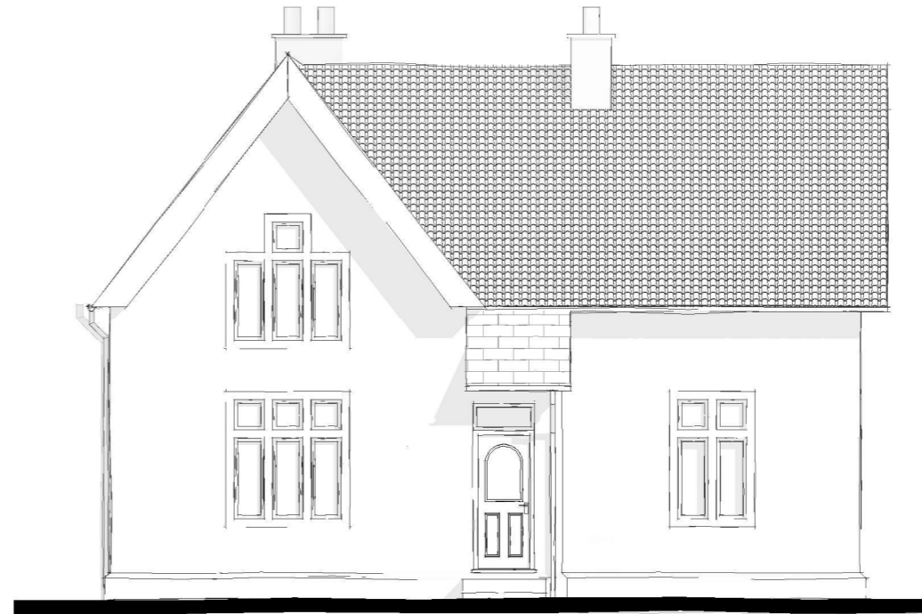
South Proposed Scale 1 : 100