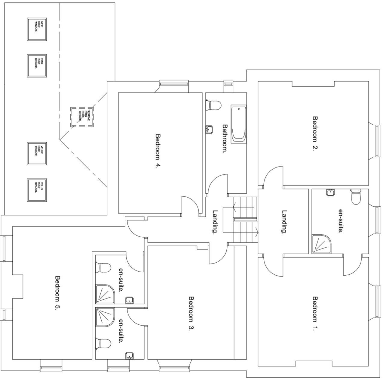
First Floor Plan. as Proposed.