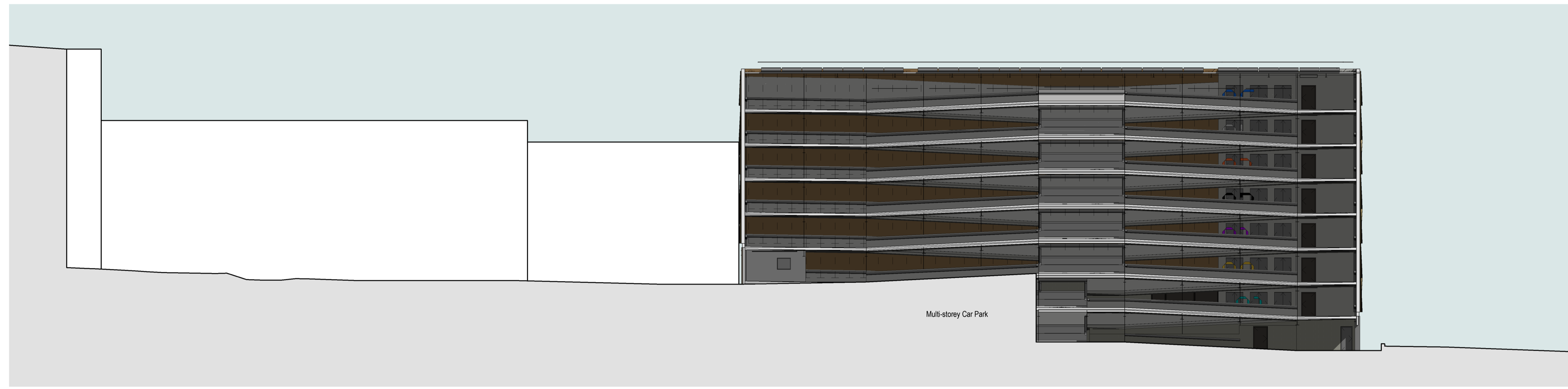
1 MSCP Site Cross Section 1 1 : 200