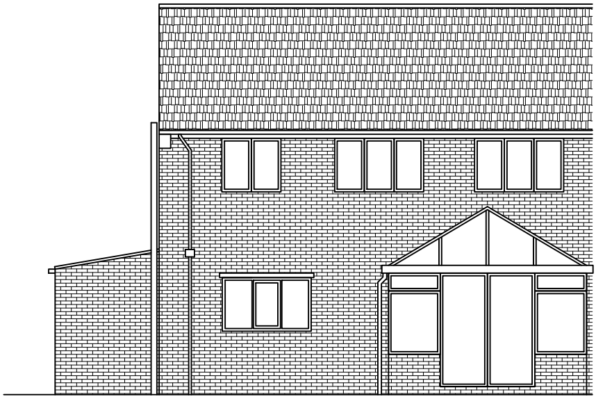
EXISTING REAR ELEVATION SCALE 1:100 AT A3