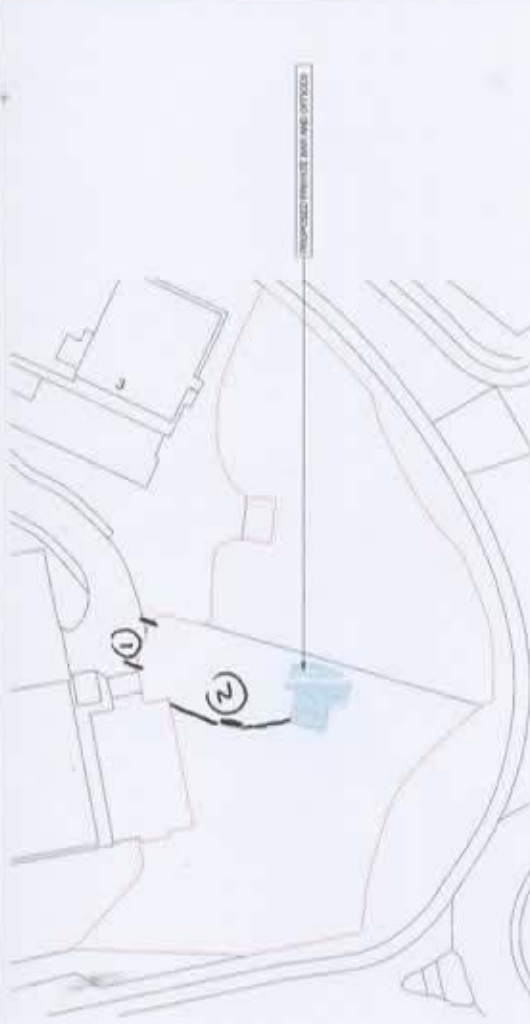
2 SITE PLAN 1:500