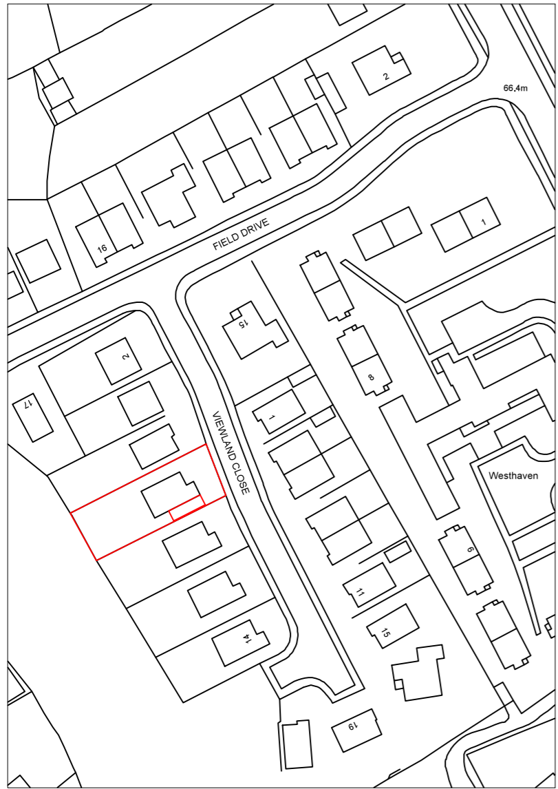
LOCATION PLAN SCALE 1:1250 AT A3