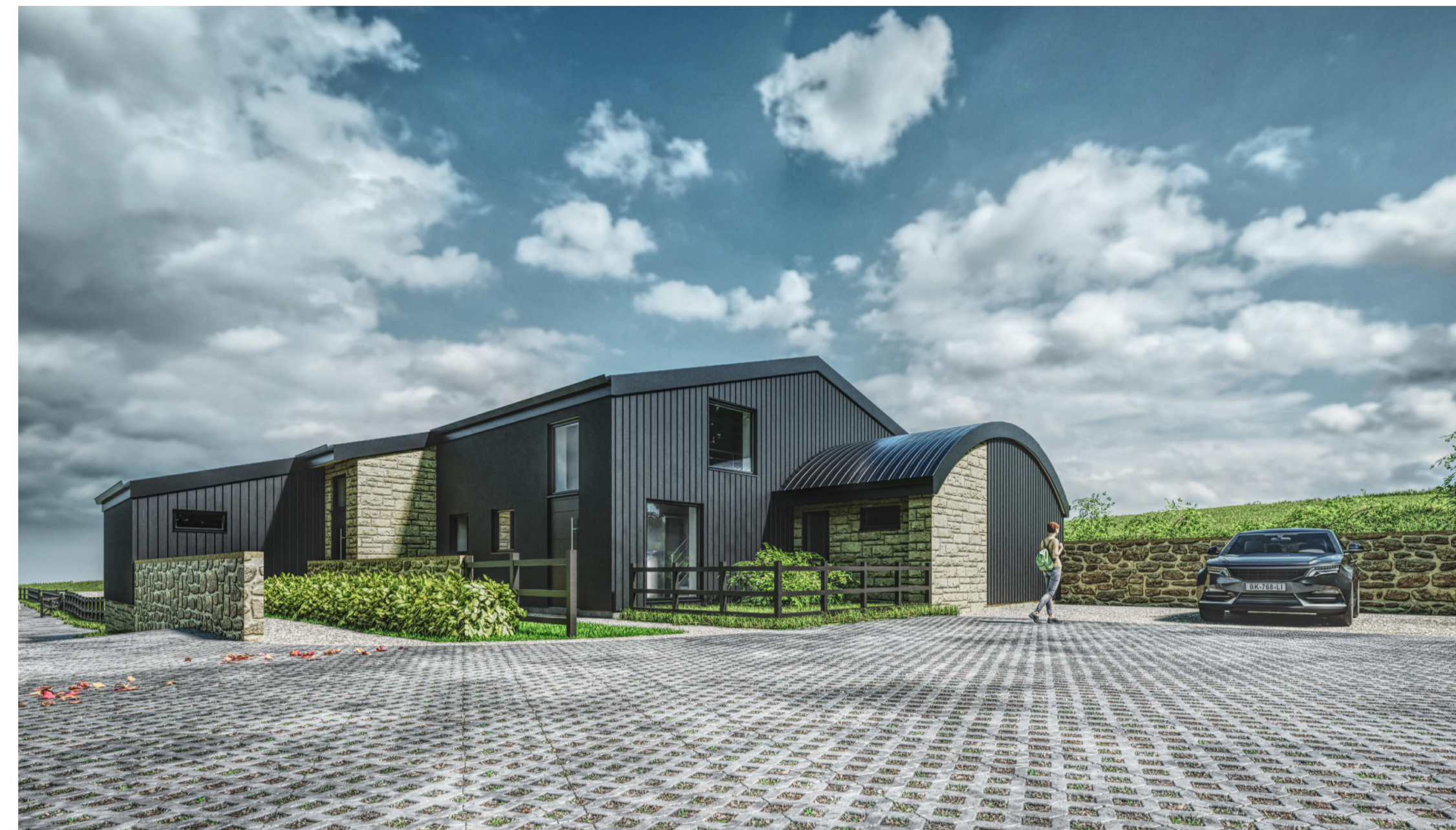
Artists Impression - Plots 2 & 3 - Looking East