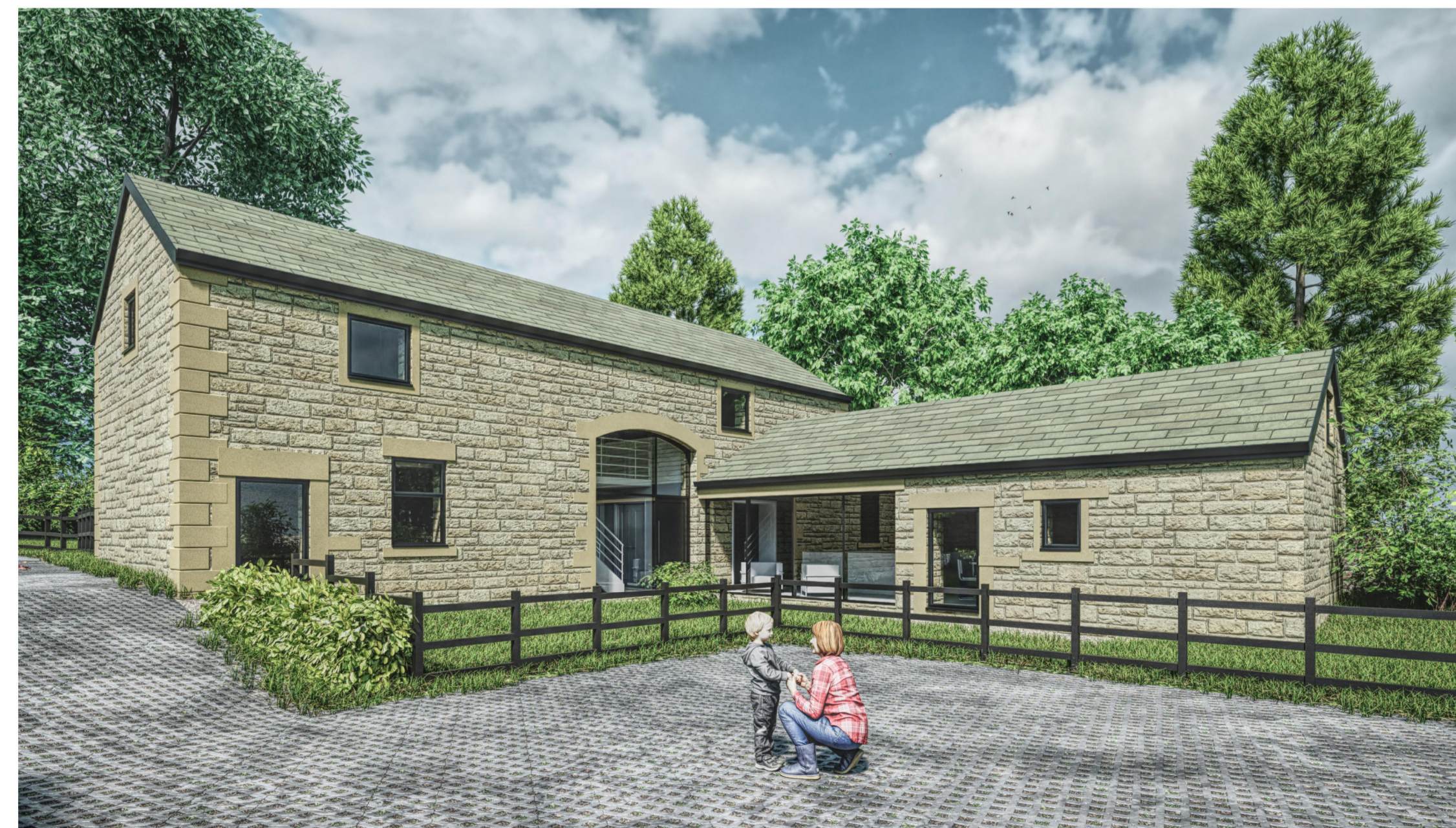
Artists Impression - Plot 1

GENERAL DO NOT SCALE FROM THIS DRAWING. ALL DIMENSIONS ARE TO BE CHECKED ON SITE AND CONFIRMED TO AUTHOR. ALL FEASIBILITY STUDIES ARE SUBJECT TO FULL SITE SURVEY + LOCAL AUTHORITY APPROVALS. ANY DISCREPANCIES OR VARIATIONS SHALL BE NOTIFIED TO CADVIS3D BEFORE WORK ON THE RELEVANT SECTION COMMENCES. THIS DRAWING SHALL BE READ IN CONJUNCTION WITH ALL RELEVANT CONSULTANTS AND/OR SPECIALISTS DRAWINGS/DOCUMENTS. THE MATERIALS AND WORKMANSHIP OF ALL RELEVANT TRADES AND BUILDING OPERATIONS SHALL COMPLY WITH THE RECOMMENDATIONS OF CURRENT BRITISH STANDARDS AND CODES OF PRACTICE. AS FAR AS REASONABLY PRACTICABLE, THIS DESIGN HAS BEEN PREPARED IN SUCH A WAY AS TO REDUCE THE RISKS TO THE HEALTH AND SAFETY OF PERSONS WHO MAY BE AFFECTED. RISK ASSESSMENTS, PRE-CONSTRUCTION INFORMATION ON HEALTH & SAFETY FILES CAN BE PROVIDED IF CADVIS3D IS INSTRUCTED IN WRITING BY CLIENT TO TAKE ON ROLE OF PRINCIPLE DESIGNER. FOR FULL GUIDELINES ON CLIENTS DUTIES DESIGNER/CONTRACTORS CDM ROLES, PLEASE VISIT RELEVANT COMRAHE GOVERNMENT WEBSITE FOR MORE INFORMATION.