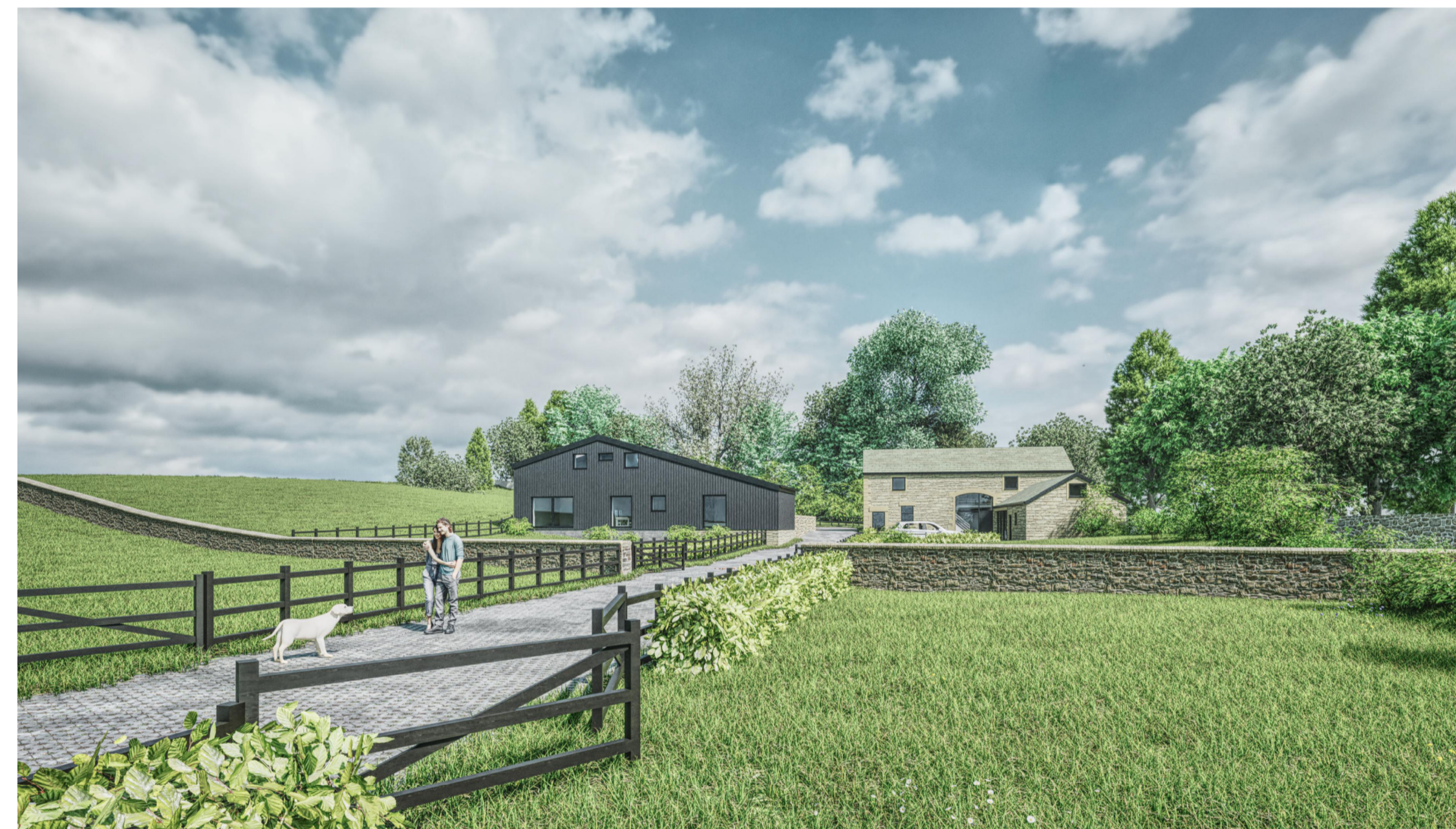
Artists Impression - Looking West