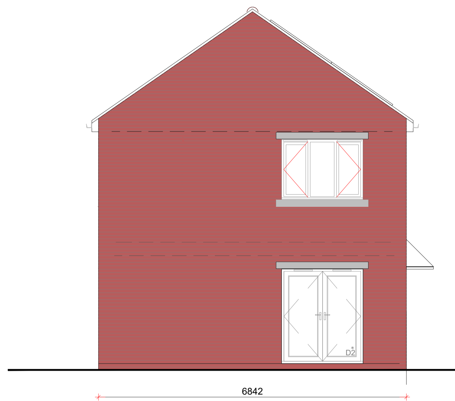
SIDE ELEVATION - PLOT 9