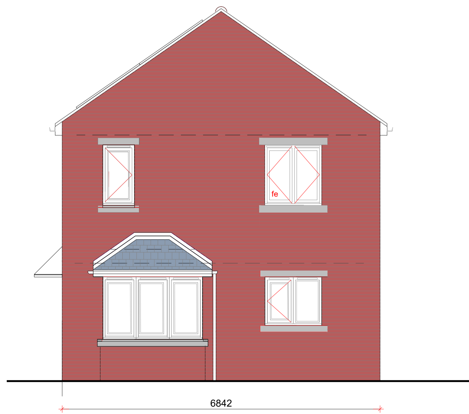
SIDE ELEVATION - PLOT 9