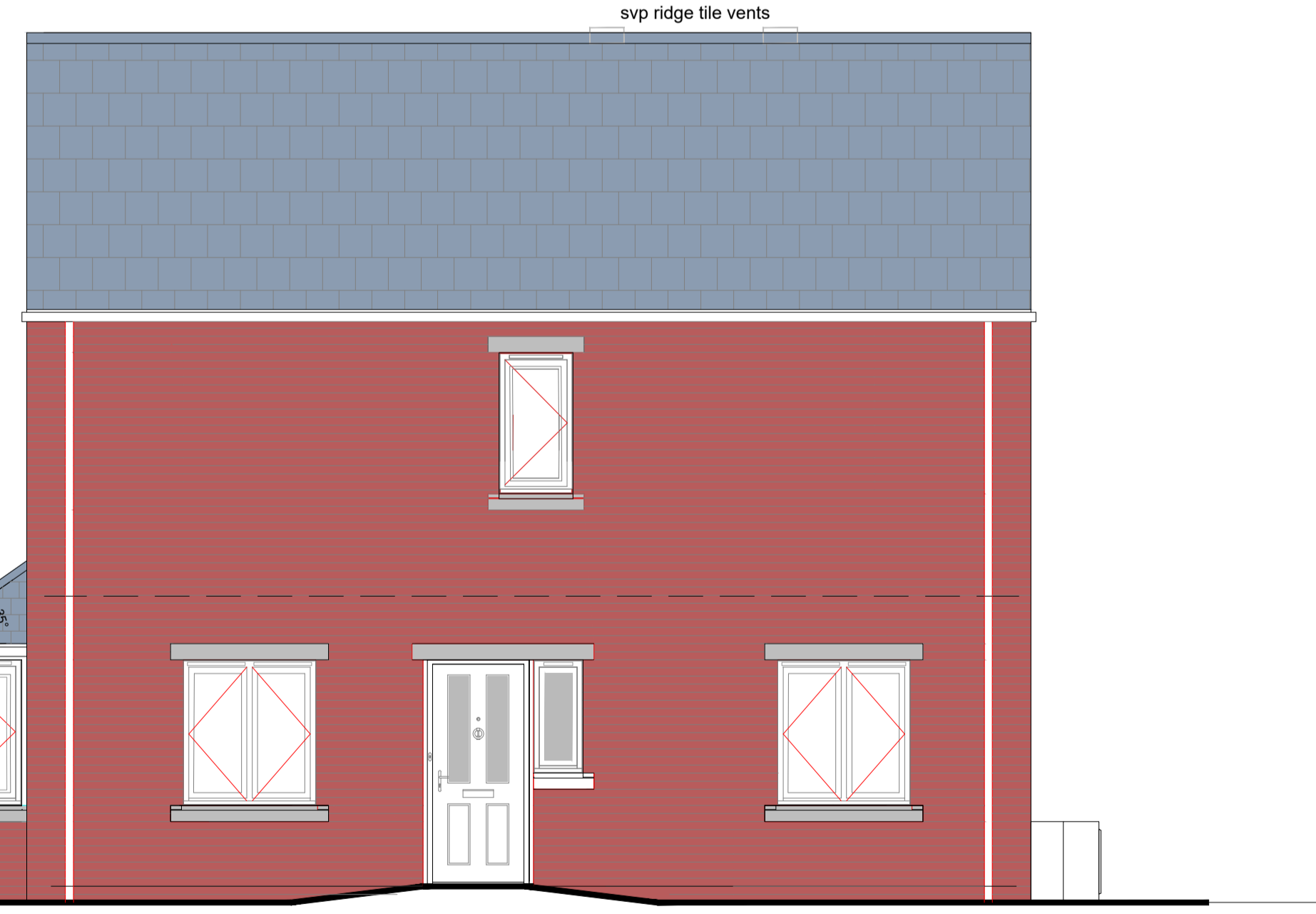
REAR ELEVATION PLOT 9