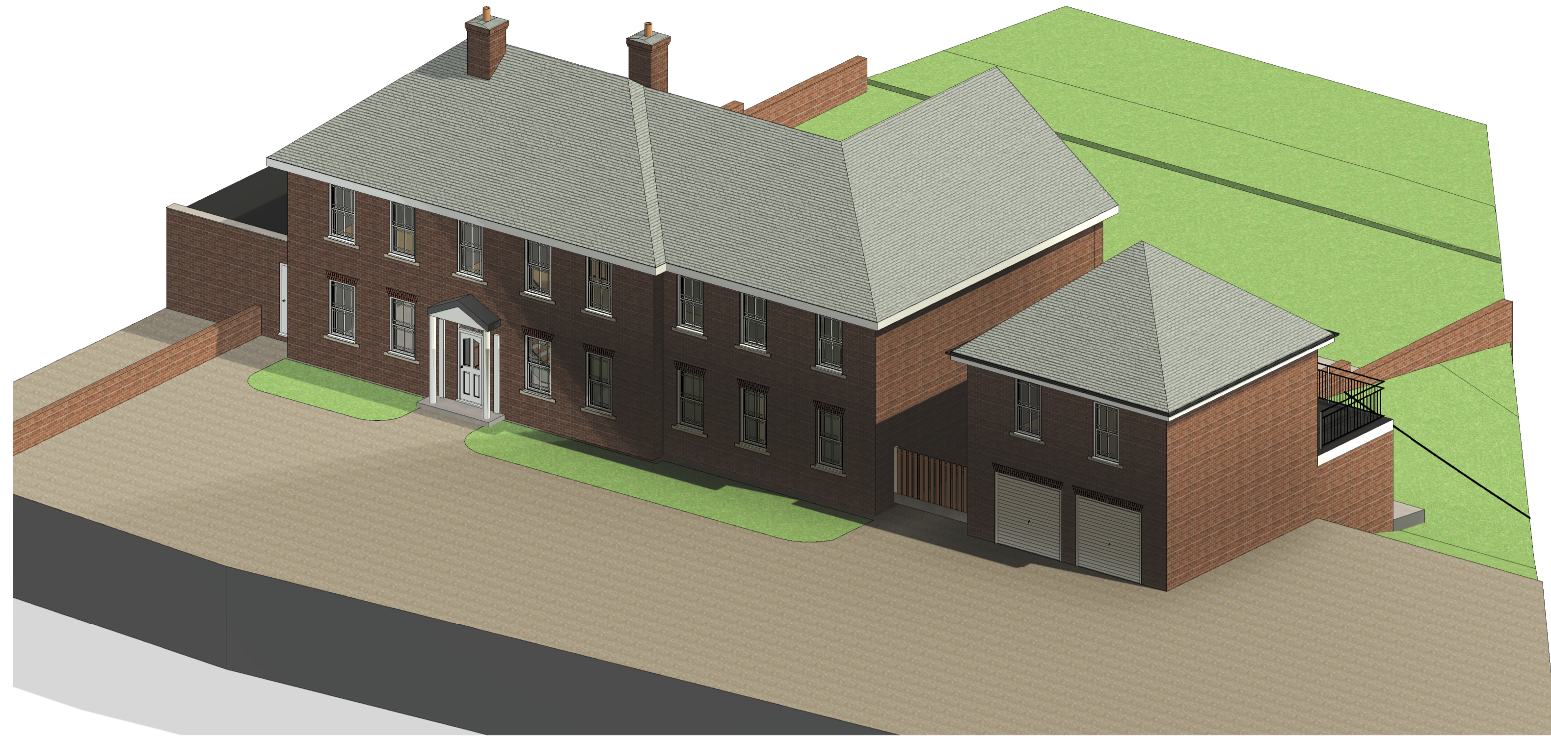
1 Principal Elevation