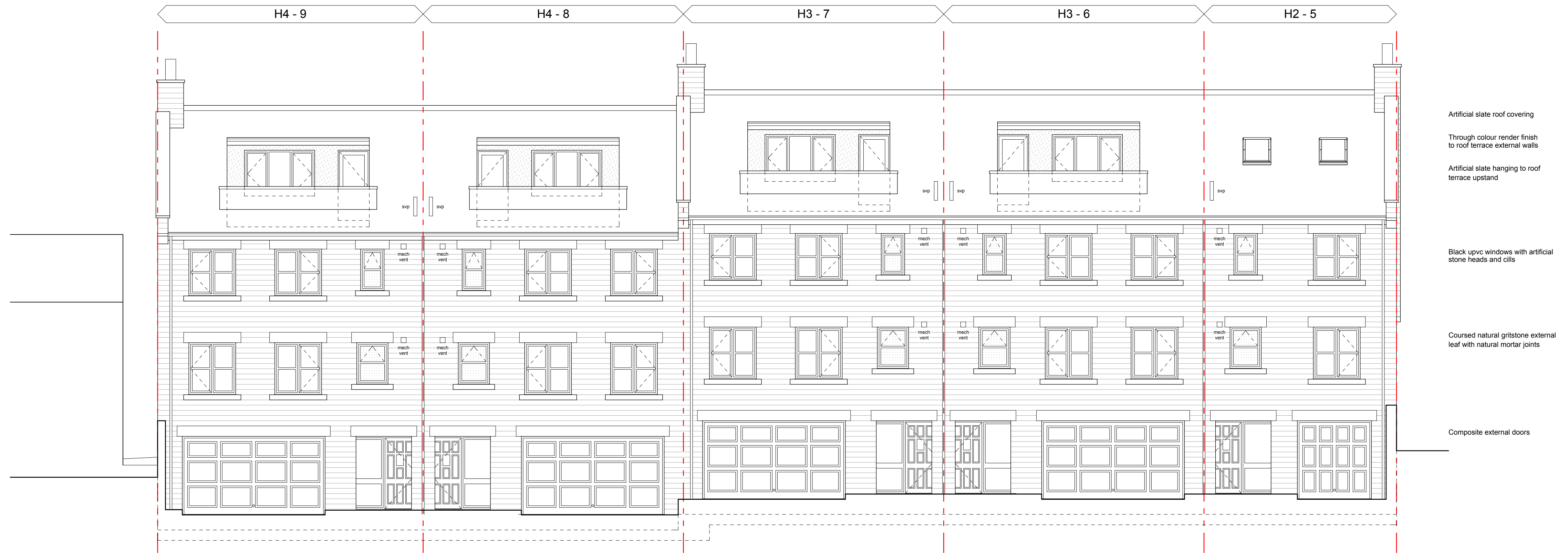
Block B - Rear / East Elevation (New Access Road)