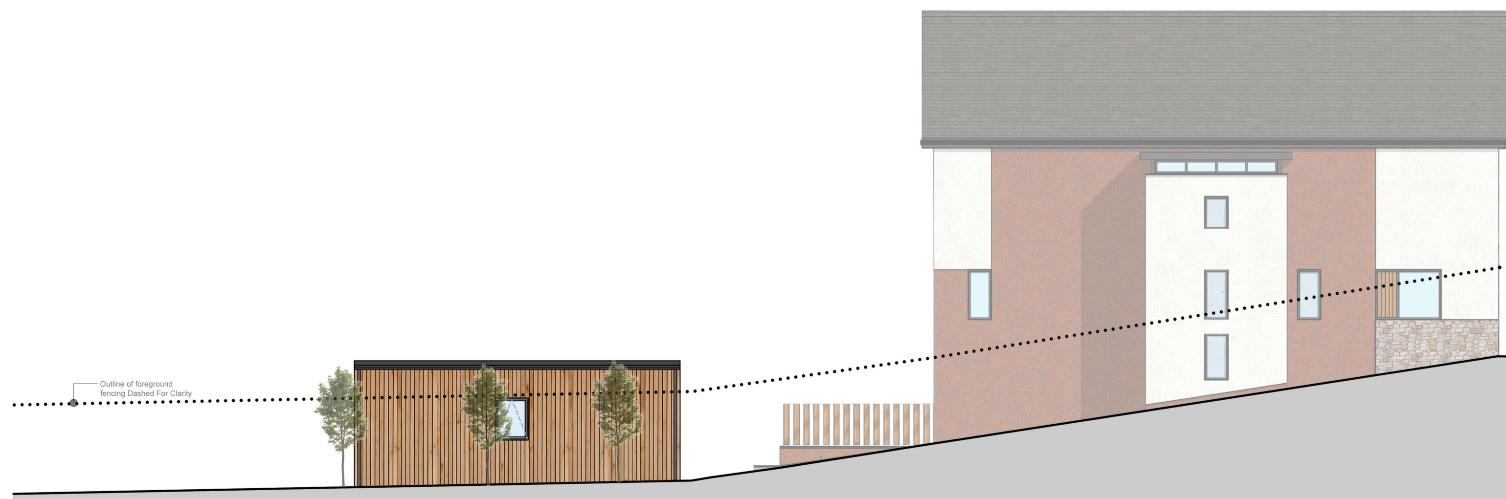
Proposed Site Elevation - E3 SCALE 1:100