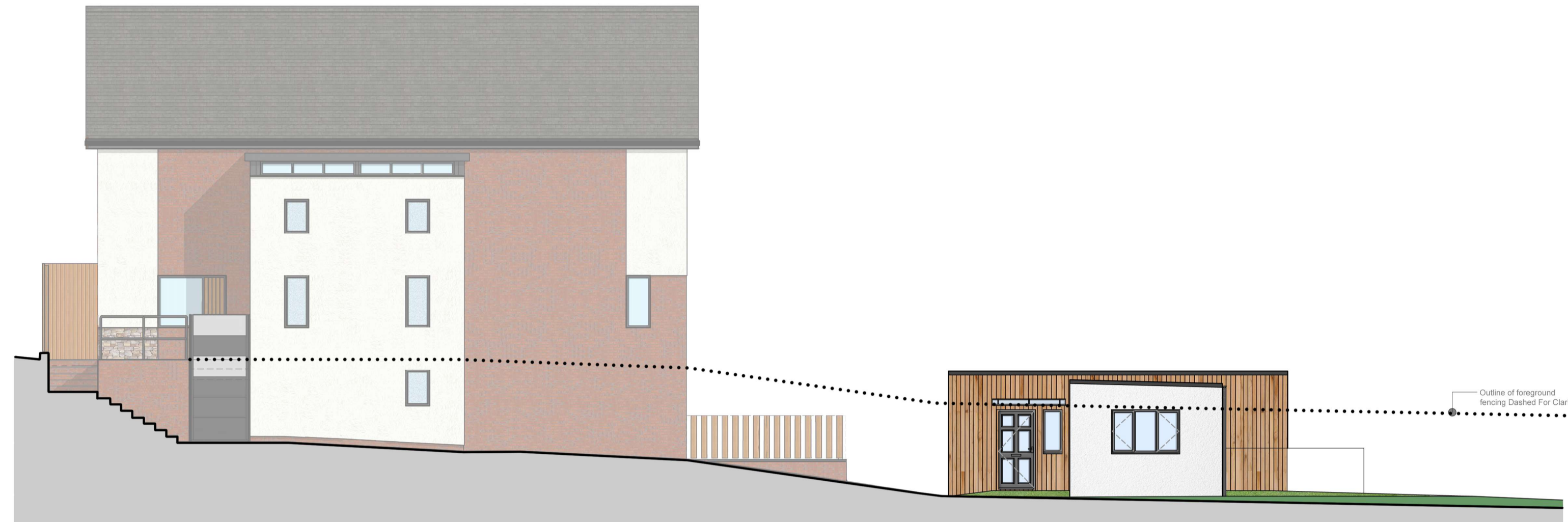
Proposed Site Elevation - E1 SCALE 1:100