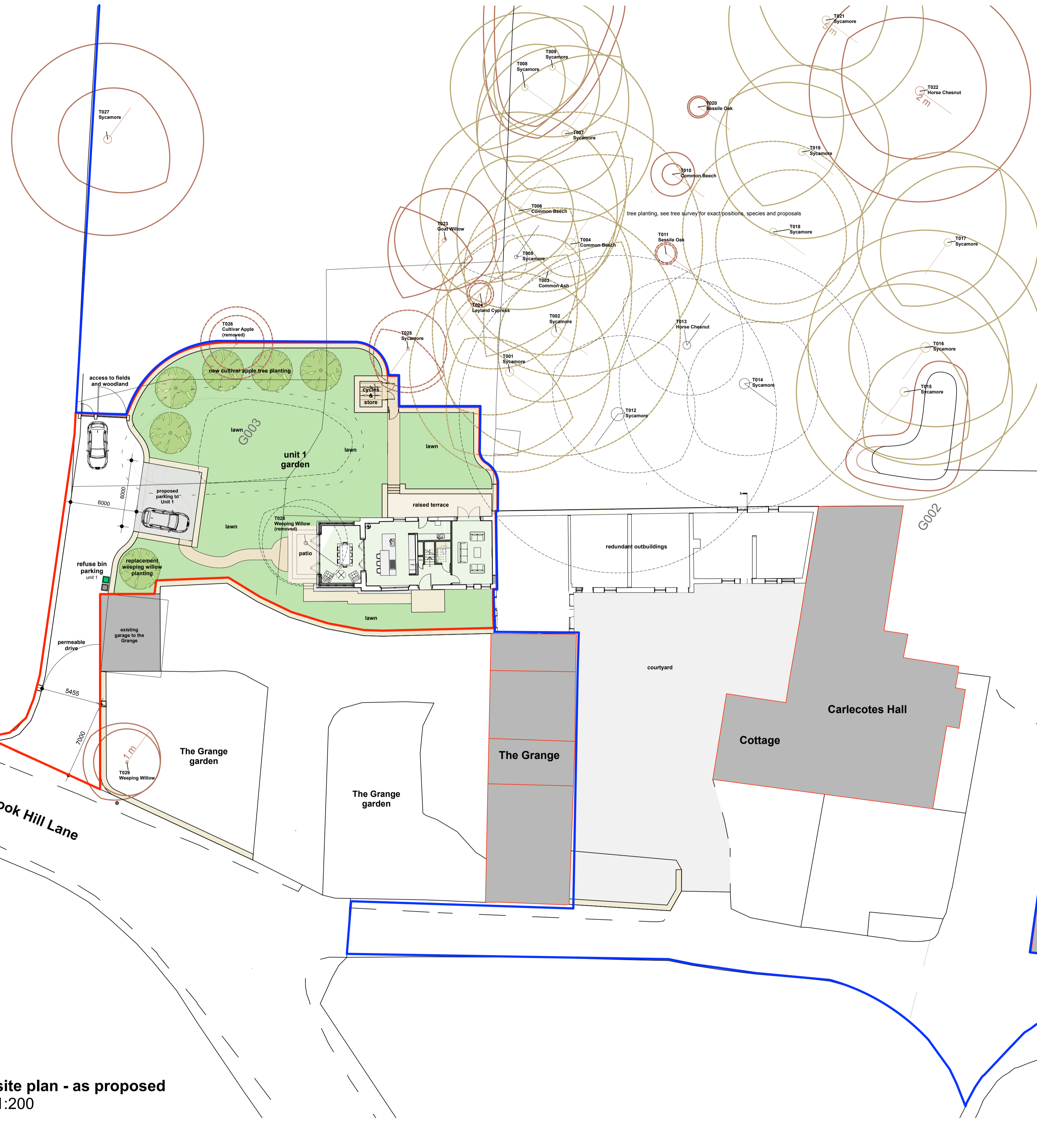
site plan - as proposed 1:200