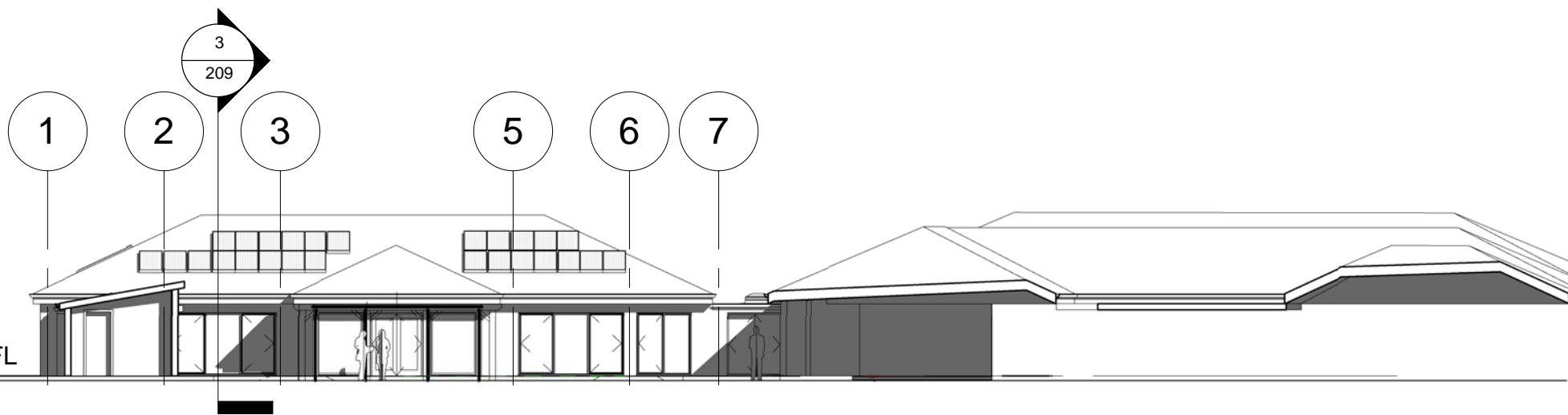
2 South 1 : 200