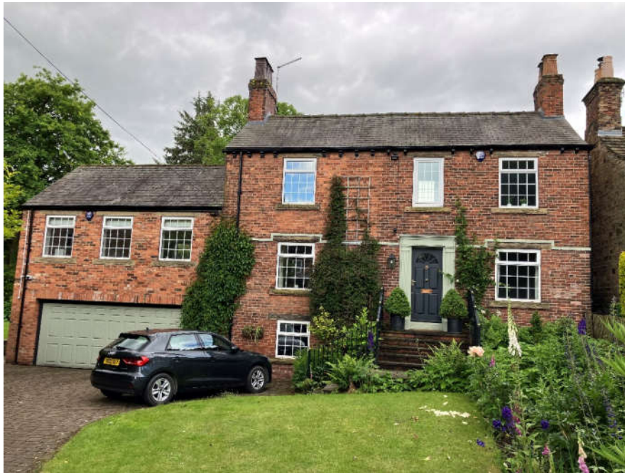
Fig 02. View of principal north west elevation of Fern House from access showing two storey side extension with garage and room above.