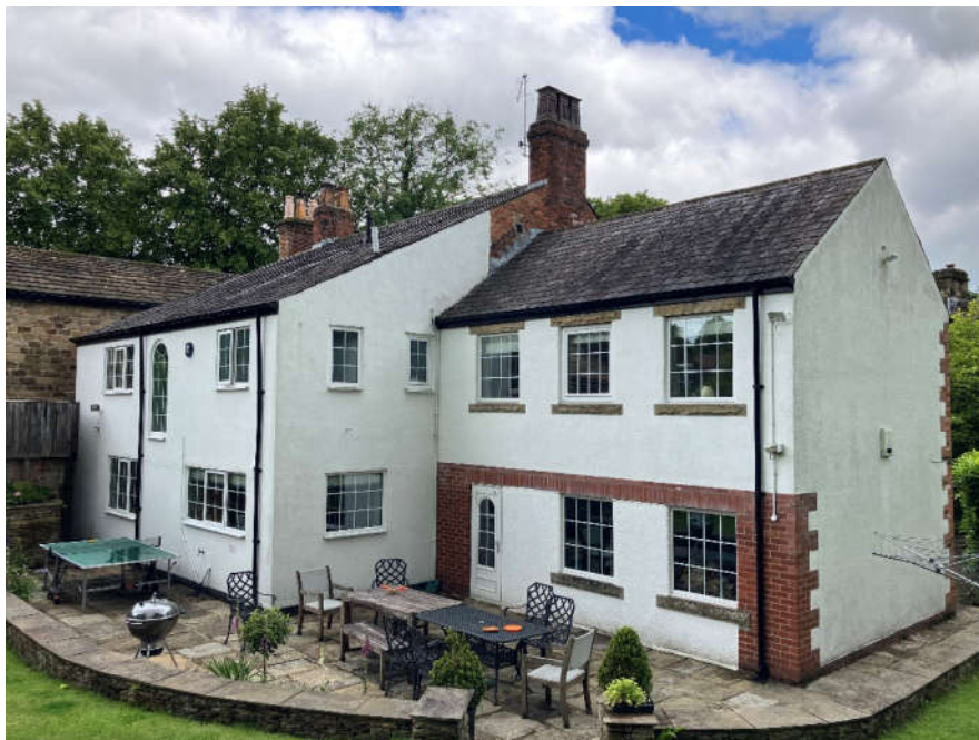
Fig 03. View of side (north east) and rear (south west) both having previously been extended.