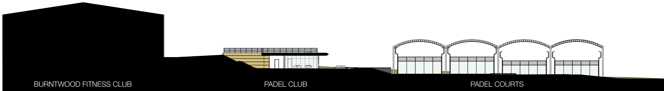
SITE SECTION TOWARDS SOUTH WEST