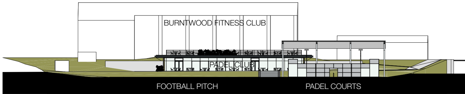
SITE SECTION TOWARDS SOUTH EAST