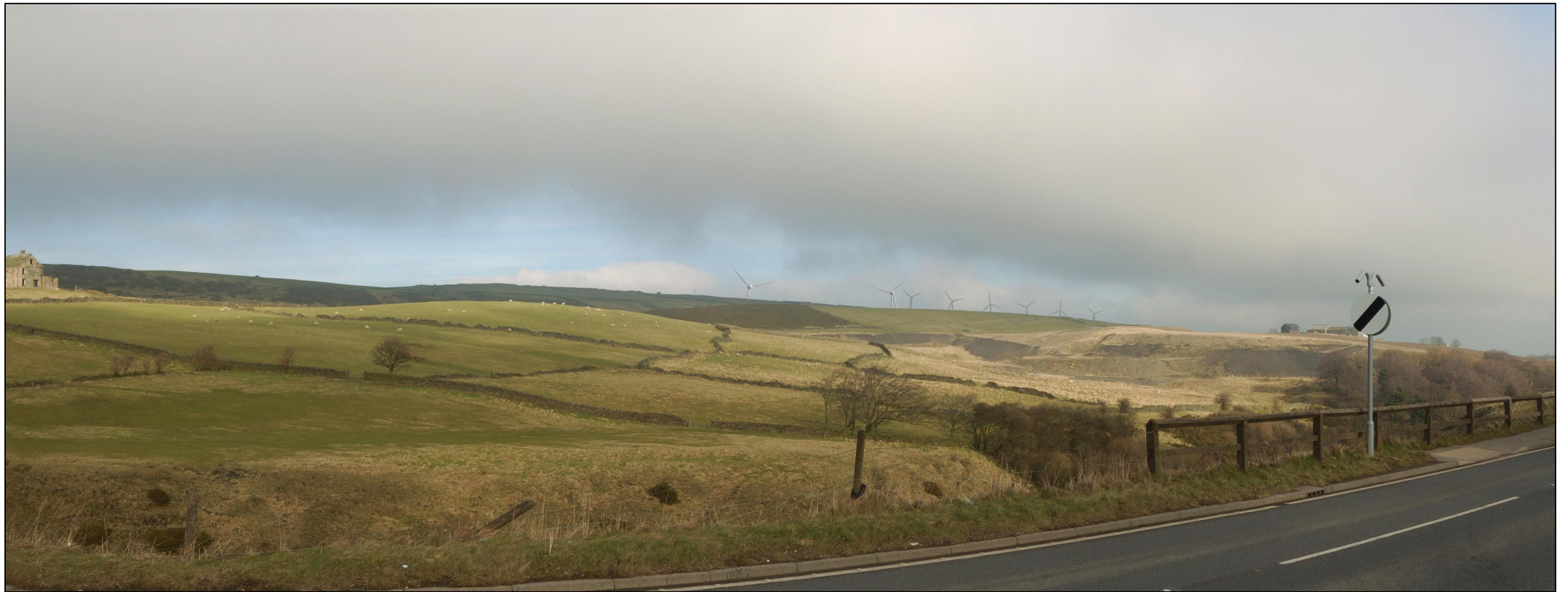
Photomontage showing proposed development from viewpoint