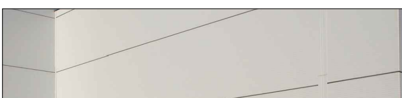
Light grey cladding