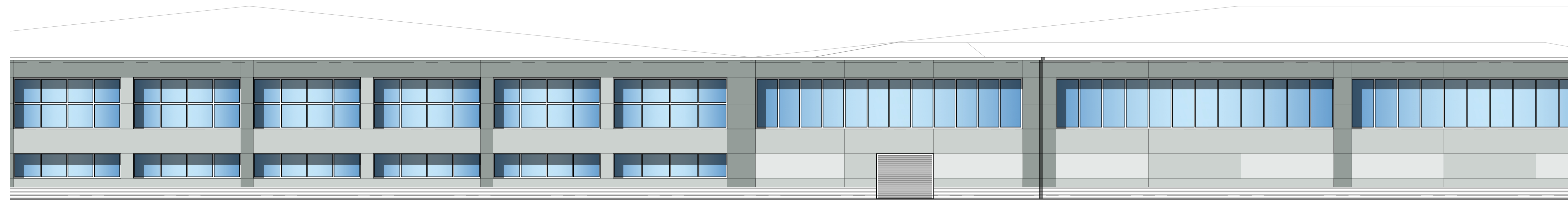
Proposed front elevation 1:100@A1