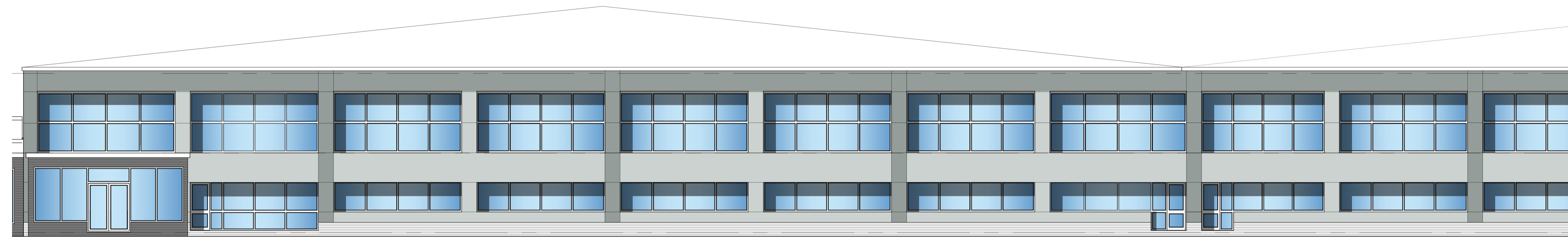
Proposed front elevation 1:100@A1