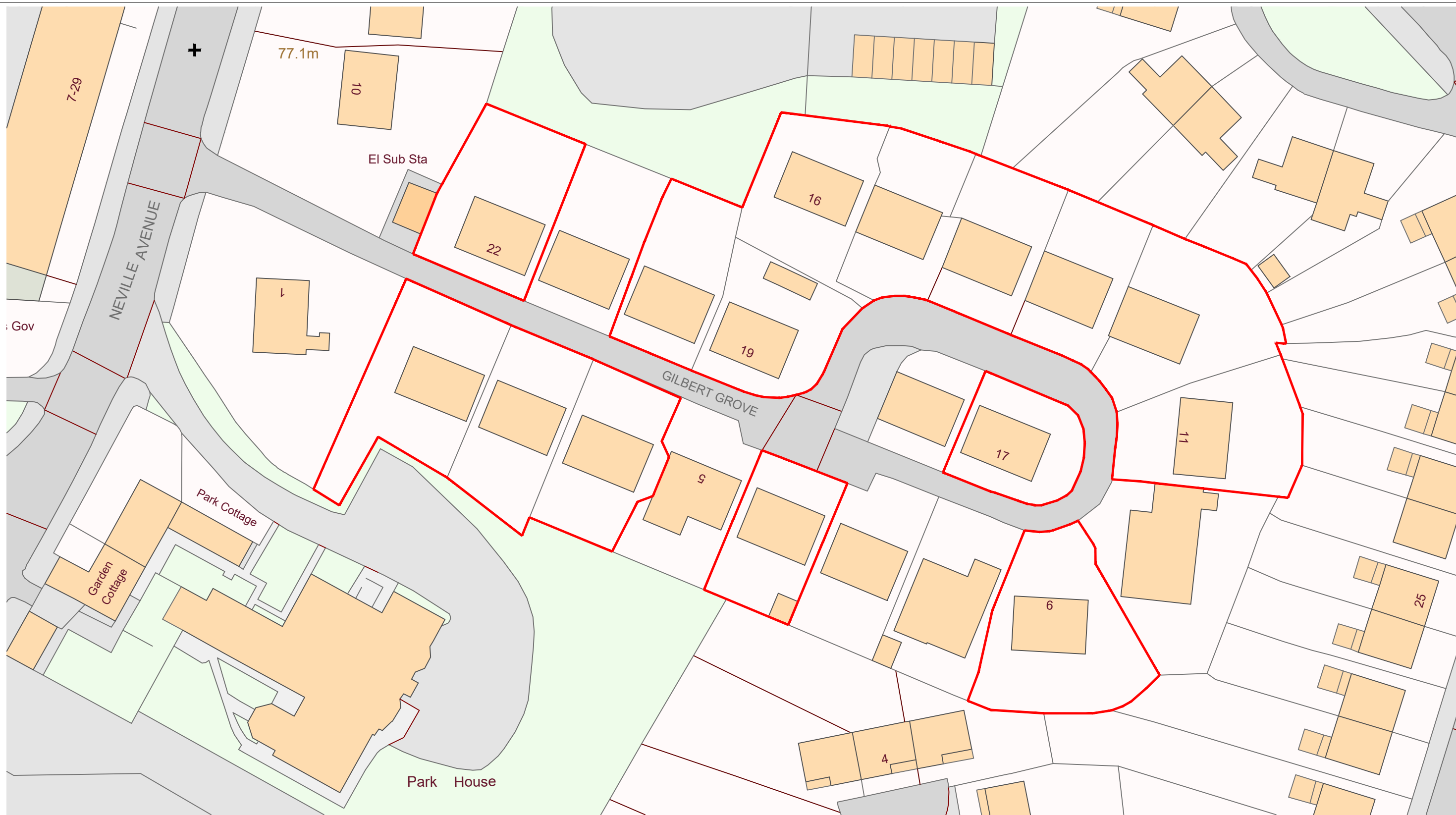
Existing Site Block Plan