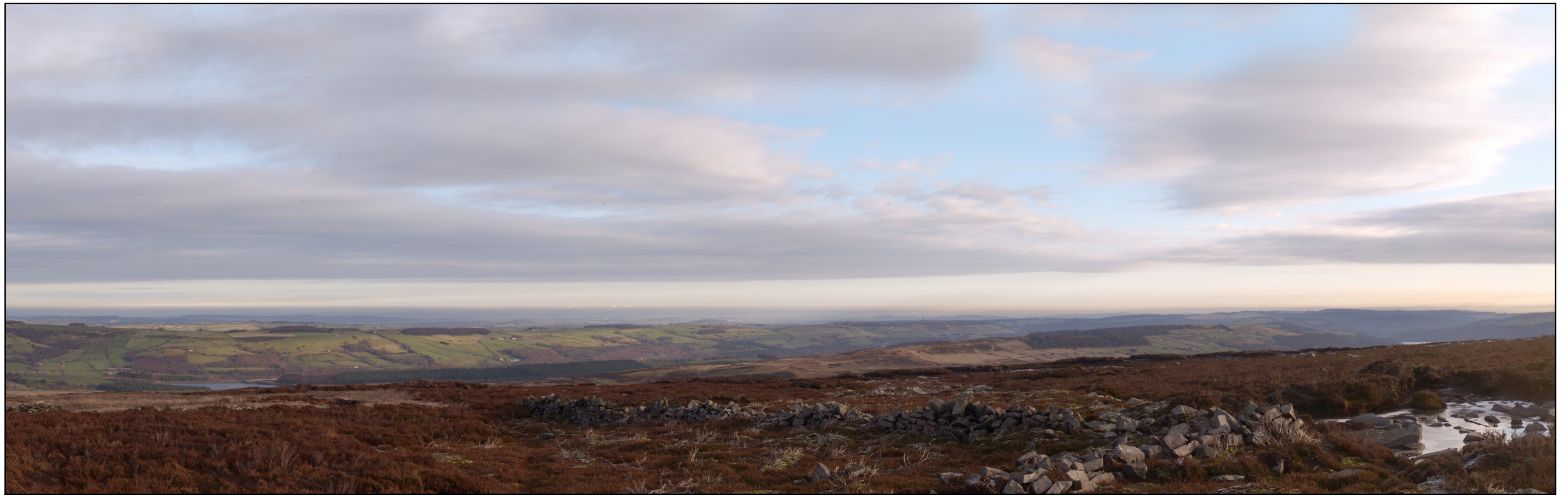
Existing view from viewpoint