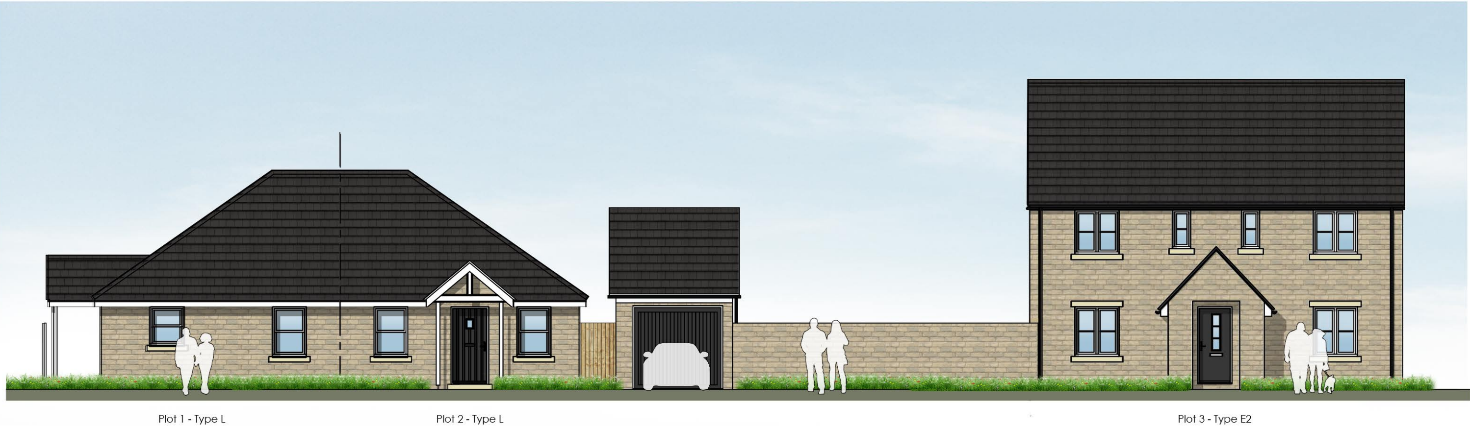
STREET SCENE B-B @ 1:100

Levels shown on street Scenes are indicative. Please refer to engineering details for further clarification.