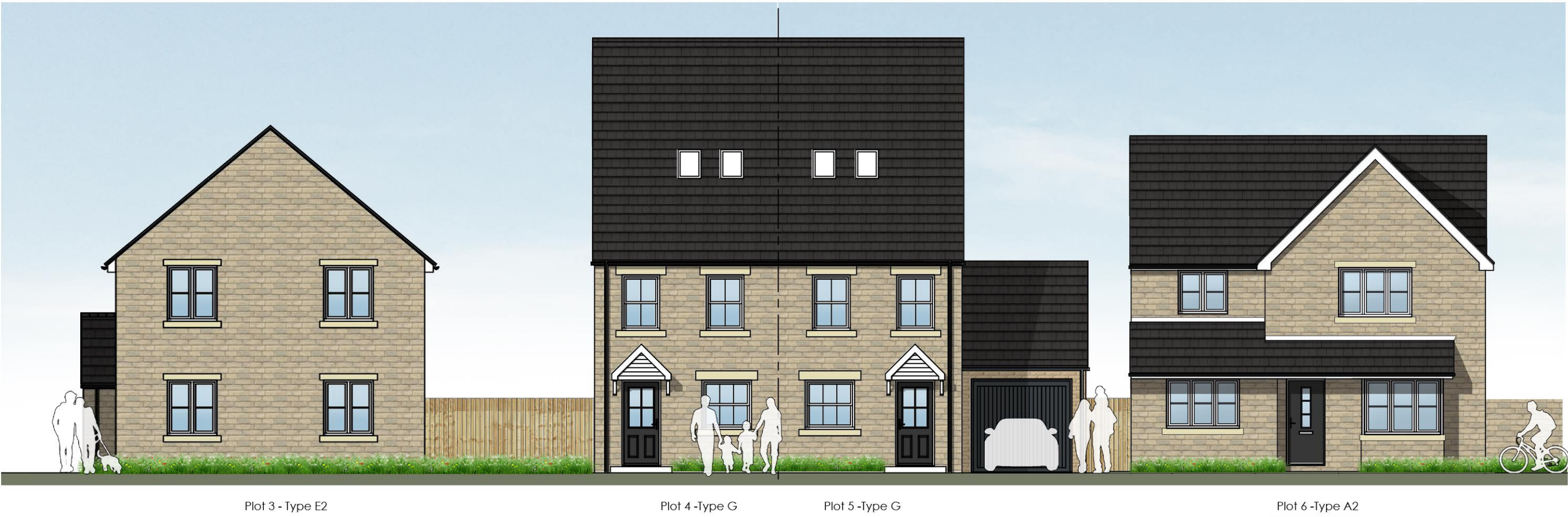
STREET SCENE A-A @ 1:100