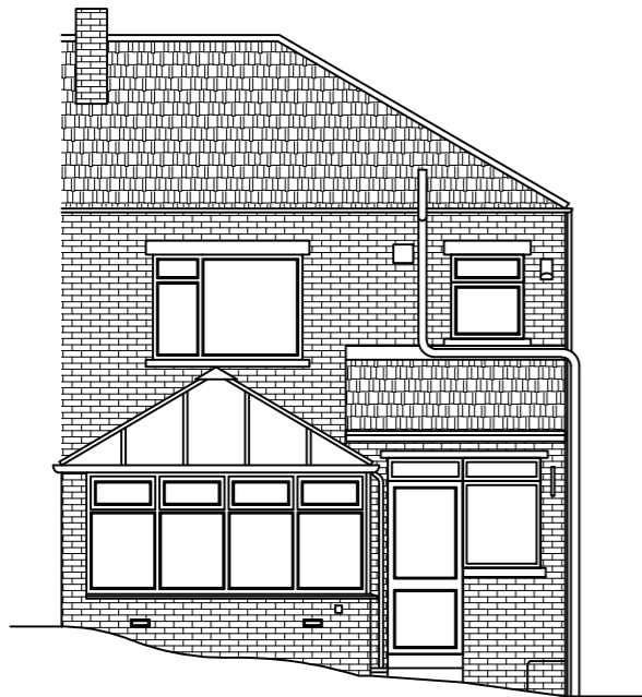
EXISTING REAR ELEVATION SCALE 1:100 AT A3