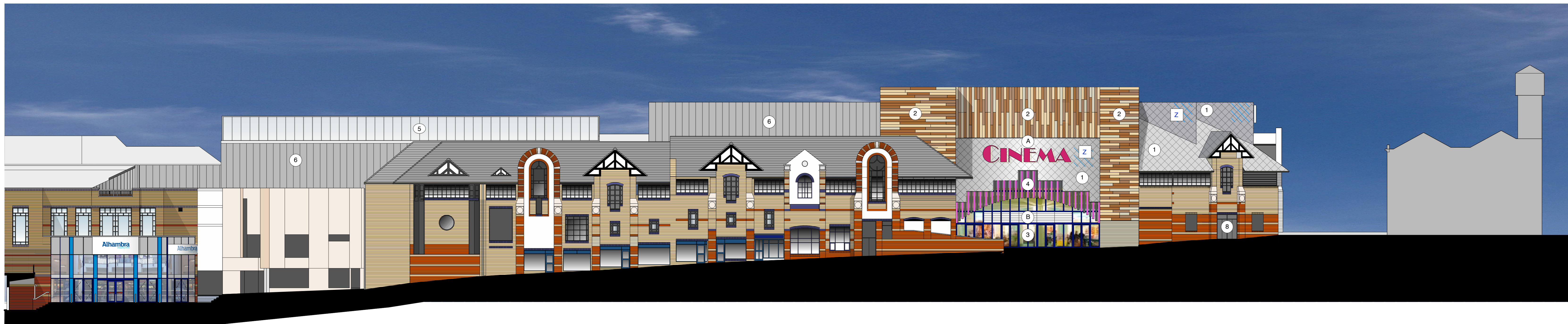
(A) NEW STREET ELEVATION