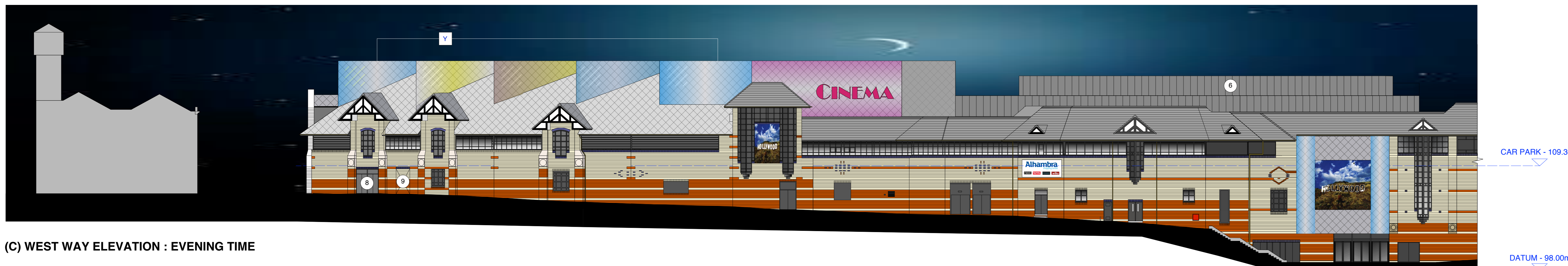
(C) WEST WAY ELEVATION : EVENING TIME