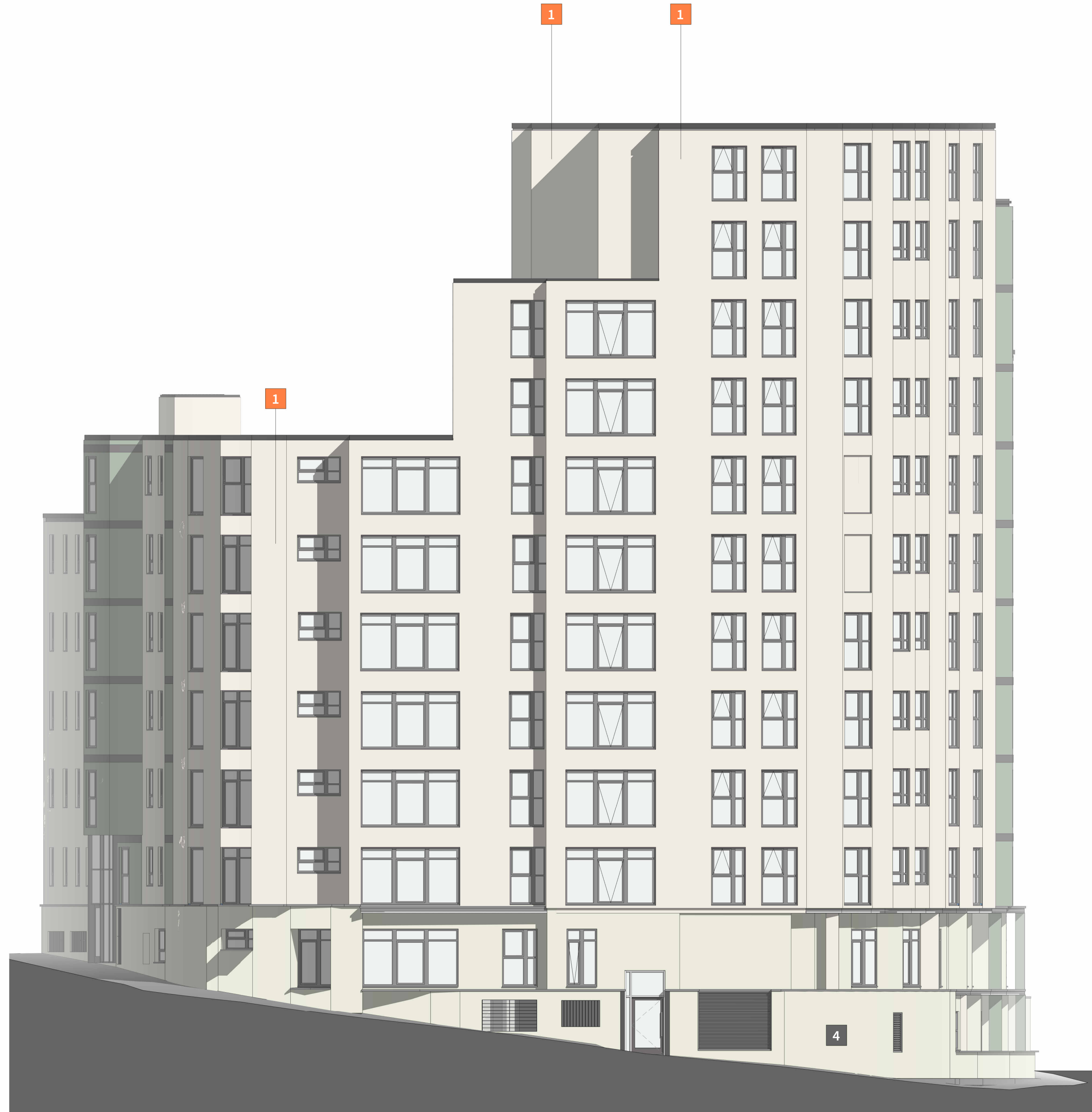
1 Proposed_Elevation - Heelis street-01 1:100

NB: REFER TO DRAWINGS, 23-021_FA-DR-200 AND 23-021_FA-DR-201 FOR FURTHER REFERENCE TO EXISTING AND PROPOSED ELEVATION DETAILS.