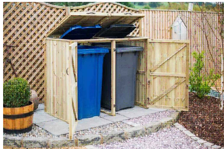
EXAMPLE BIN STORE