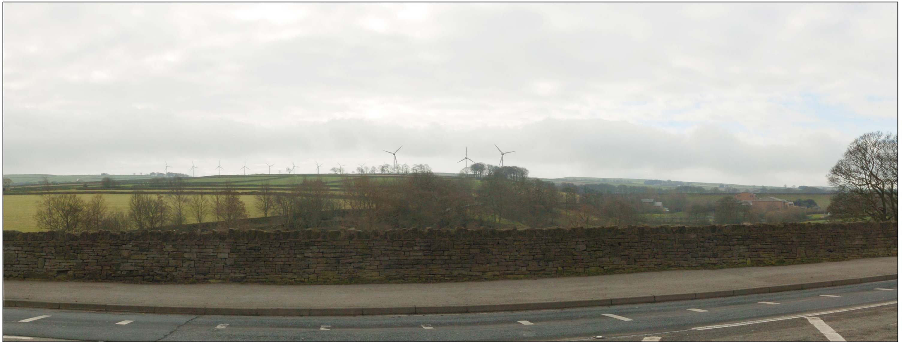
Photomontage showing proposed development from viewpoint