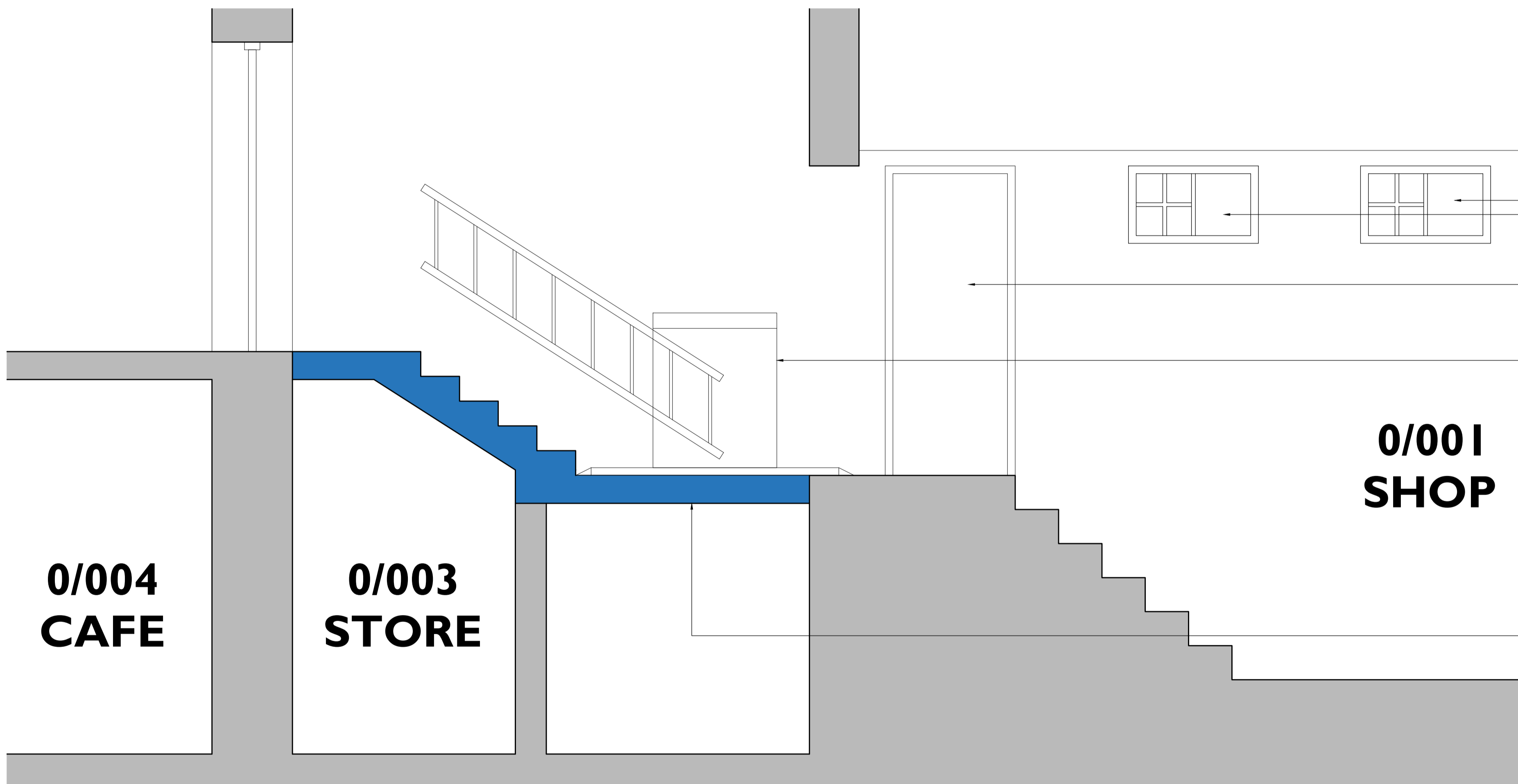
3 Proposed Amendments to Existing Staircase 0/001 3000 1:10

Carefully remove modern coverings from 2no. windows and reinstate existing windows. Renew internal security shutters and form new timber covering to existing to offer aesthetic improvement to existing security measures